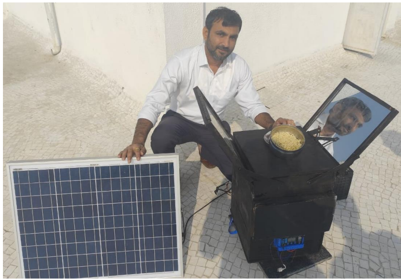
Fig.1. (A) Experimental setup with coil arrangements with battery and measuring instruments