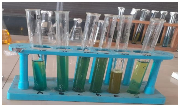
Fig no:4 Phytochemical analysis

An antibacterial activity evaluation was conducted utilising agar well diffusion in an experiment. The test organism was inoculated into MH agar plates, which are specifically designed for bacteria. The standard inoculums were uniformly distributed on the medium's surface. Wells were created in the agar medium and filled with different quantities of Methanol by dissolving it. Three wells were prepared, each with varying concentrations of extract and a standard antibiotic. The plate was cooled for 20 minutes to facilitate dispersion. The plates with bacterial cultures were incubated at 37°C for 21 hours, whereas the plates with bacterial cultures were incubated at room temperature (30-32°C). The antimicrobial efficacy was evaluated by measuring the zone of inhibition against the test organism over a 48-hour period . 6