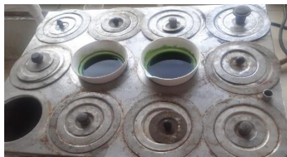
Figure No :2 Drying Of Filtrate