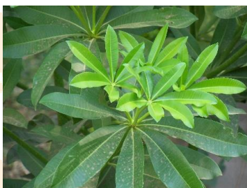
Figure No: 1 Alstonia Scholaris Leaves

As a member of the Apocynaceae family, Alstonia scholaris is also referred to as Blackboard tree, Indian devil tree, and White cheese wood in English; in Hindi, Saptparna, and in Sanskrit, Vishwamukha. This tropical tree is endemic to the Indian subcontinent and is evergreen. In India, traditional medical systems such as homoeopathy, Ayurveda, and homoeopathy employ this drug extensively to treat a variety of illnesses. This plant's various parts are utilised in traditional medicine. 3