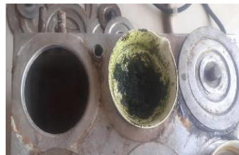
Figure No: 3 Extract