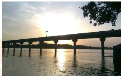
Kaveri River, Tiruchirapalli

Its size is attributed to its historical associations with the veneration of snakes and native mother goddesses, which are evident in the numerous Amman (mother goddess) shrines and Nagakals (stone slabs featuring an image of intertwined snakes) that may be found nearby and are primarily visited by non-Brahmins. According to Brahmanical Hinduism, Kaveri is the Southern Ganga, and the hilltop is the Dakshin (south) Kailash Mountain. Given that the Kailash-Ganga holy mountain-river combination being the most sacred combination in Hinduism, it is not unexpected that the Pallava ruler Mahendravarman excavated the Lalitankura Pallaveshvaram cave temple dedicated to Shiva during the 7th century.