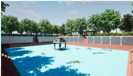
Redesigned pilgrim path

The four streets that lead to the Rockfort Temple and the far-off vistas of the hill should be framed by large pillars that indicate the entrances to the cultural heritage zone. For the pilgrim who must climb a total of 417 rock-cut stairs to reach the Uchchipillayar Temple at the very top, an alternate pilgrim path is suggested that passes through natural settings, avoids the commercial areas, and allows panoramic views of the hill. This walkway would have rest spots in tiny mandapams, water-filled tanks surrounded by ghats (steps), and shaded groves of coconut and pipal trees. The pilgrim would follow this road starting at Nandi Kovil Street and start the trek at the Teppakulam, which has been redesigned with little shrines strewn across the ghats that slope down to the water and colonnades running on all four sides of the tank. From there, the pilgrim would follow the stone road to the upper Umayan Kulam and Nandavanam, which has beautiful jasmine and champa trees. The pilgrim would use Rockfort South Street and continue climbing to the Thayumanavar and Uchippillayar temples with their mandapams after taking a bath and resting here.