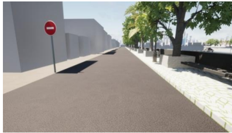
Proposed pilgrim road