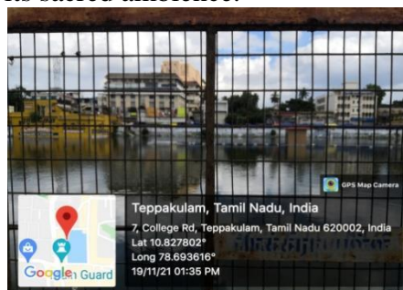
Teppakulam in Rockfort temple

The visual cacophony created by billboards and flashing neon signs above the stores is inconsistent with the gopuram architecture on the street, which marks the starting point of the pilgrims' upward ascent. The four-story structures on the street have caused the most extreme obscuring of the sacred hill and its shrines. Roughly 70% of visitors to the fort area come just to shop. Temple towns have long been centers of trade, but the sacred center and its related activities are in danger of being overtaken and dominated by the masses that the fort area's bazaar streets attract. There are hardly many open places in this congested, often hectic metropolitan setting, especially green spaces. The remnants of the temple garden include the little sacred tank at Nandavanam, the nearby coconut grove at Umayankulam, the historic tanks Teppakulam and Umayankulam, and another tank and grove around Nandi Kovil Temple. During the float festival, when oil lamps are ignited to cover the tank, the statue of Ganesha is transported to Teppakulam, an important religious meeting site. Now, a metal barrier with restricted boat access surrounds it, significantly lessening the impact that the body of water surrounded by holy trees and mandapams would have made. The pilgrim path has suffered the greatest loss to its sacred ambience.