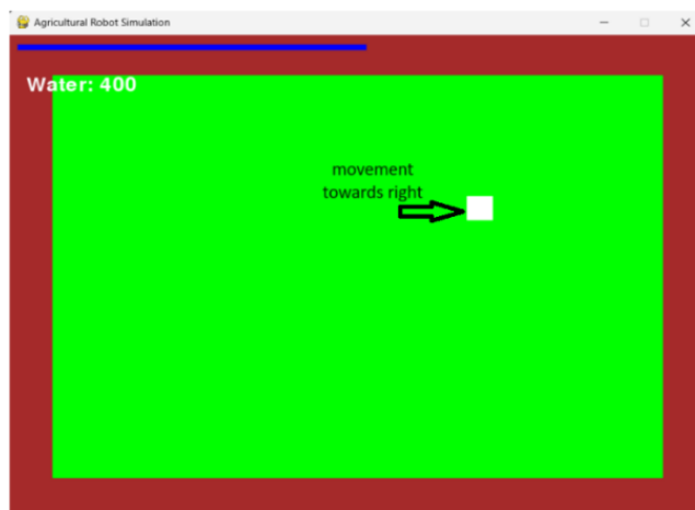
Fig [4] :(robot moving towards right)