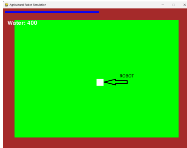
Fig[2]:(designed robot via python program )