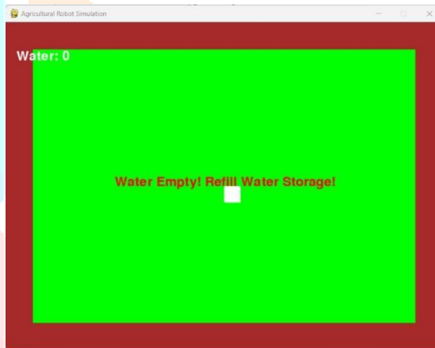
Fig[3]:(alerting the user to fill the water)