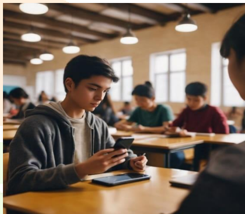
Fig 1: Virtual classroom

The development of an Android-based Virtual Classroom application using Firebase represents a significant step forward in the evolution of education. By harnessing the power of Firebase, this project offers a dynamic and versatile platform that can transform the way we teach and learn. As the world continues to embrace online and remote learning, this application promises to provide an enriching and accessible educational experience that can benefit students and educators alike. With real-time interaction, multimedia capabilities, and scalability, this innovative solution is set to revolutionize the landscape of learning and shape the future of education.