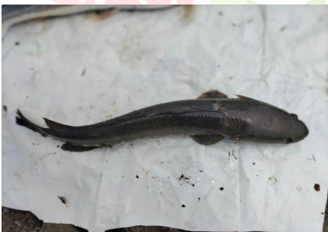
Figure 13. Channa striata