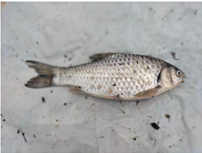
Figure 17. P. sarana