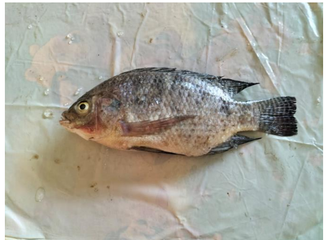
Figure 12. Tilapia