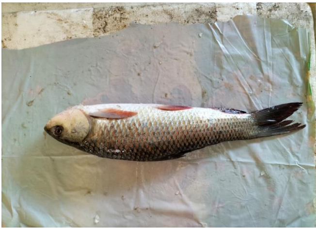
Figure 10. Labeo rohita