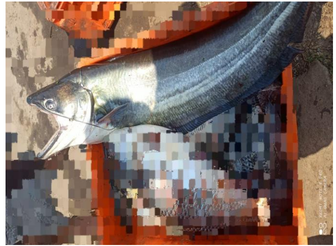
Figure 18. W attu