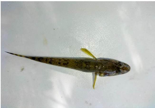
Figure 5. Glossogobius guiris