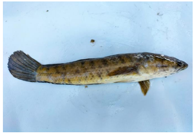
Figure 9. Channa punctata