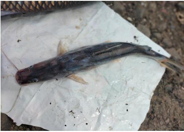
Figure 16. S. seenghala