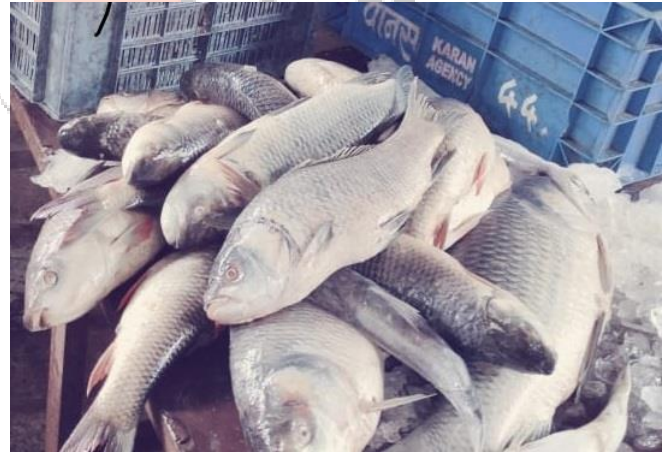
Figure 8. Catla catla