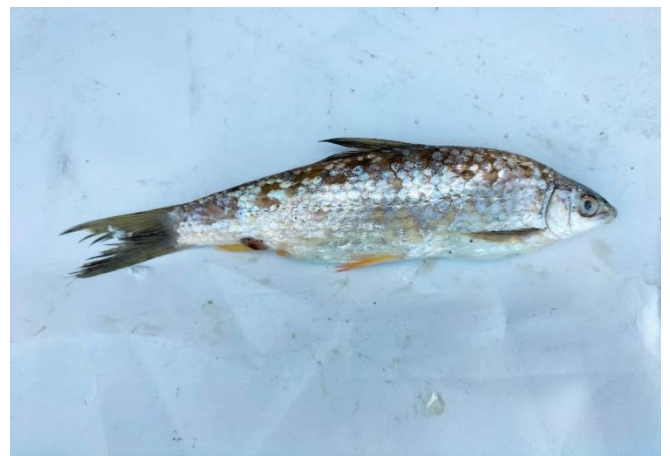
Figure 6. Mugil cephalus