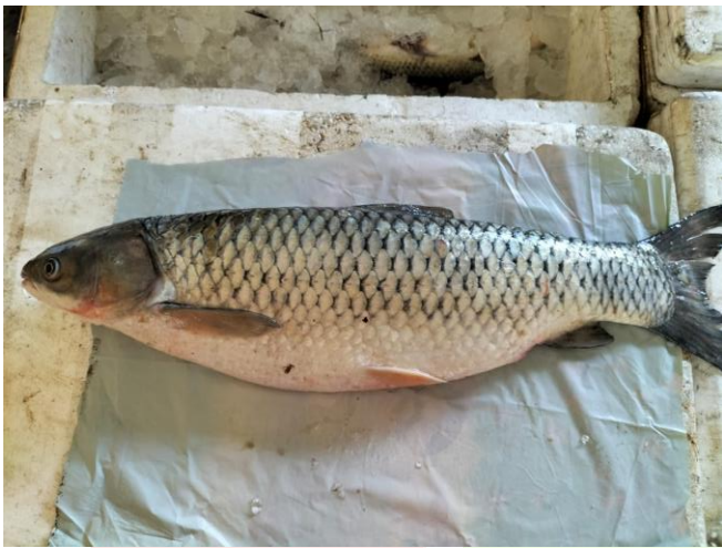
Figure 11. Cirrhinus mrigala