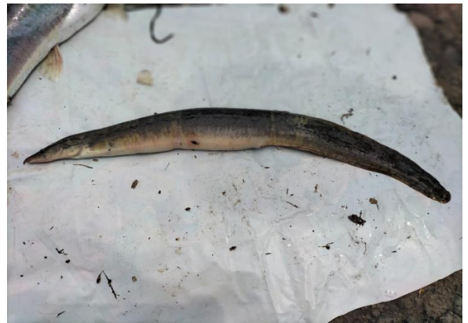
Figure 15. A bengalensis