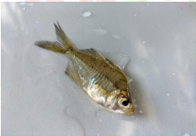
Figure 7. Ambassis nama