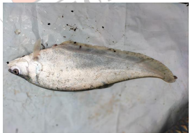
Figure 14. N. notopterus