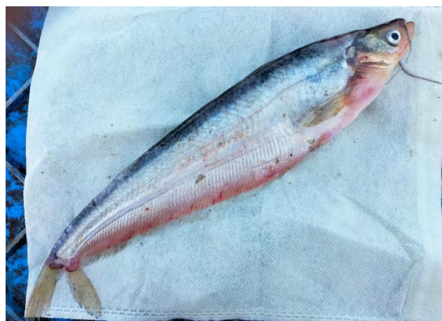
Figure 3. Ompok bimaculatus