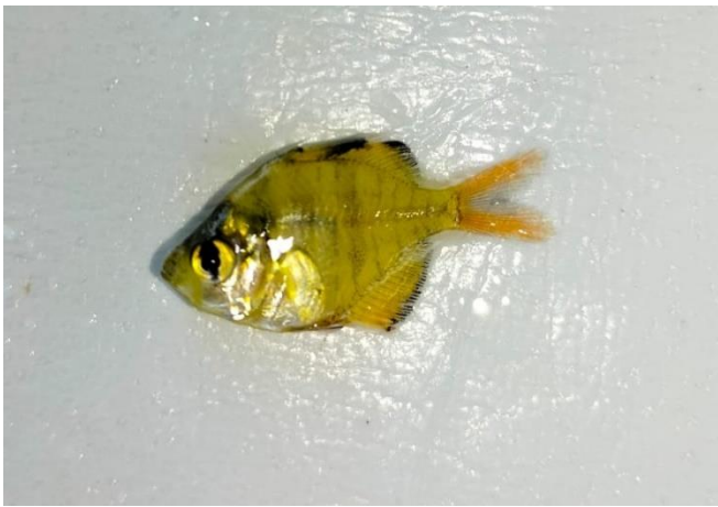
Figure 4. Ambassis ranga