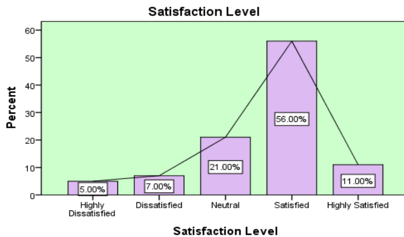
Chart 03: Result of Pearson’s Chi-square test.