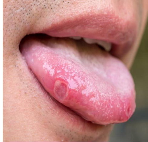
Fig. Aphthous stomatitis.