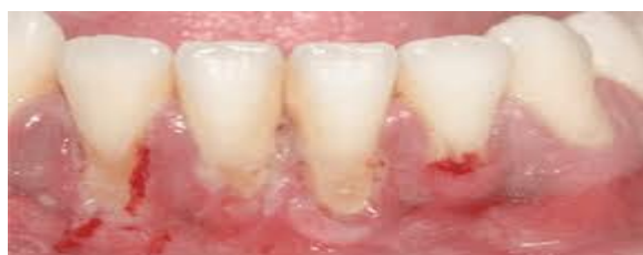
Fig. Acute necrotizing ulcerative gingivitis infection

A non-specific ulceration illness that almost exclusively affects the gingivae is acute destructive ulcerative periodontal. Diabetes with poor management, tobacco use, a weakened immune system, and perhaps psychological stress are all related contributing factors [34]. Cleaning and flossing, as well as minor trauma, typically hurt the patient. The gingiva might get desquamated or develop a bulla with blood if it is rubbed. Postmenopausal women are more likely to suffer from the condition, but they are not the only ones. A few of the conditions that could exhibit clinically with analogous lesions are bullous pemphigoid, allergic stomatitis, and erosive lichen planus [35].