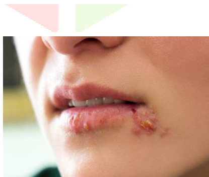
Fig. Herpes simplex viruses 1

Several infections have the potential to lead to oral ulcers. Herpes simplex type 1 (HSV-1) is the primary viral cause of ulcers. Those who are impacted may develop many, small, superficial ulcers on their oral mucosa. Frequent enlargement and ulceration of the gingiva resemble acute necrotizing ulcerative gingivitis. Despite the fact that it was once believed to be a disease of childhood, primary HSV-1 infection typically arises in the second or third decade of life [28]. About 5% of individuals with initial HSV-1 infection (cold sores) experience recurrent episodes of herpes labialis. This involves ulcers, vesiculation, pustulation, paraesthesia, and erythema at the mucocutaneous junctions of the lips and/or the nose. Herpes labialis risk factors include pregnancy, exposure to UV light, and concurrent illness [29,30].