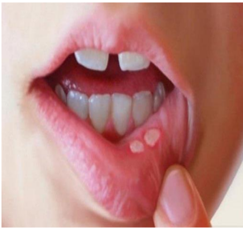
Fig. Aphthous stomatitis.