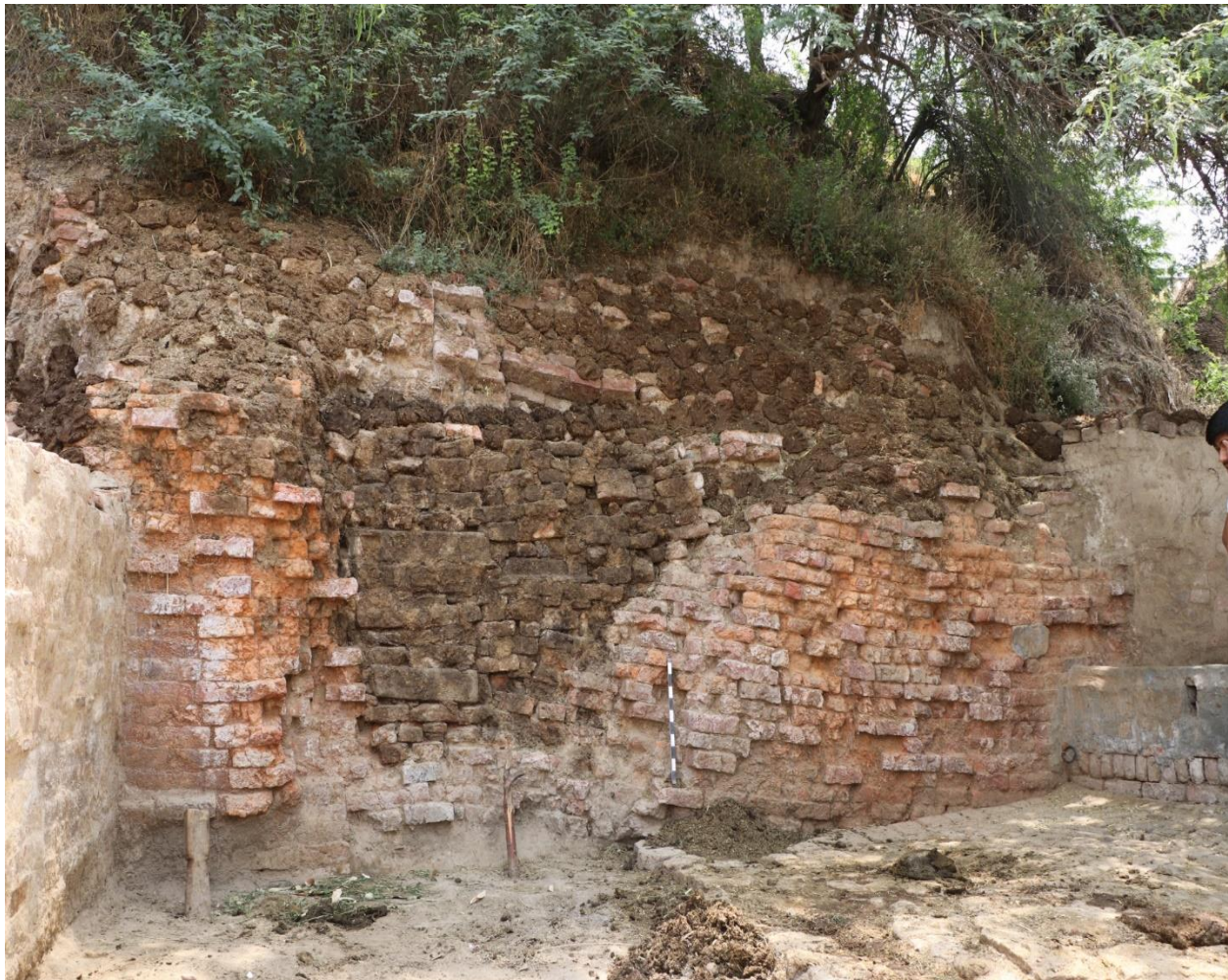
Fig-2, Bricks structure of Buddhist Stupa at western part of prl-1

Some bricks of big and small sizes have also been installed for which mud mortar has been used. The foundation of stupa is still buried in the ground. The visible part of the structure starts turning inward after reaching a height of about 170 cm from the ground (fig 2) to make the upper part circular. It is certified that the entire part of the stupa is still present in a completely safe condition. From here toy cart wheels, sling balls, copper objects, pottery etc. have come to light at the time of exploration.