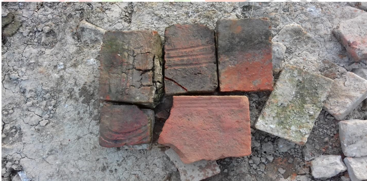
Different types of bricks find at mound no. prl-1

The shape and ornamentation of Kushan periods bricks obtained from here different. Here huge walls are seen going in different directions. Whose masonry has been done with mud Mortar On which about 4 to 5 types of designs have made with different hand figures.