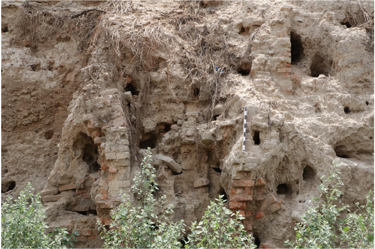
Fig-3, Structures of street and walls north-western part of PRL-1

After a gap at some height the structures of Lakhori bricks are also clearly visible on the upper side. The information gathered during the exploration show that there were small chambers shaped structures made of bricks for meditation or used for worship etc.