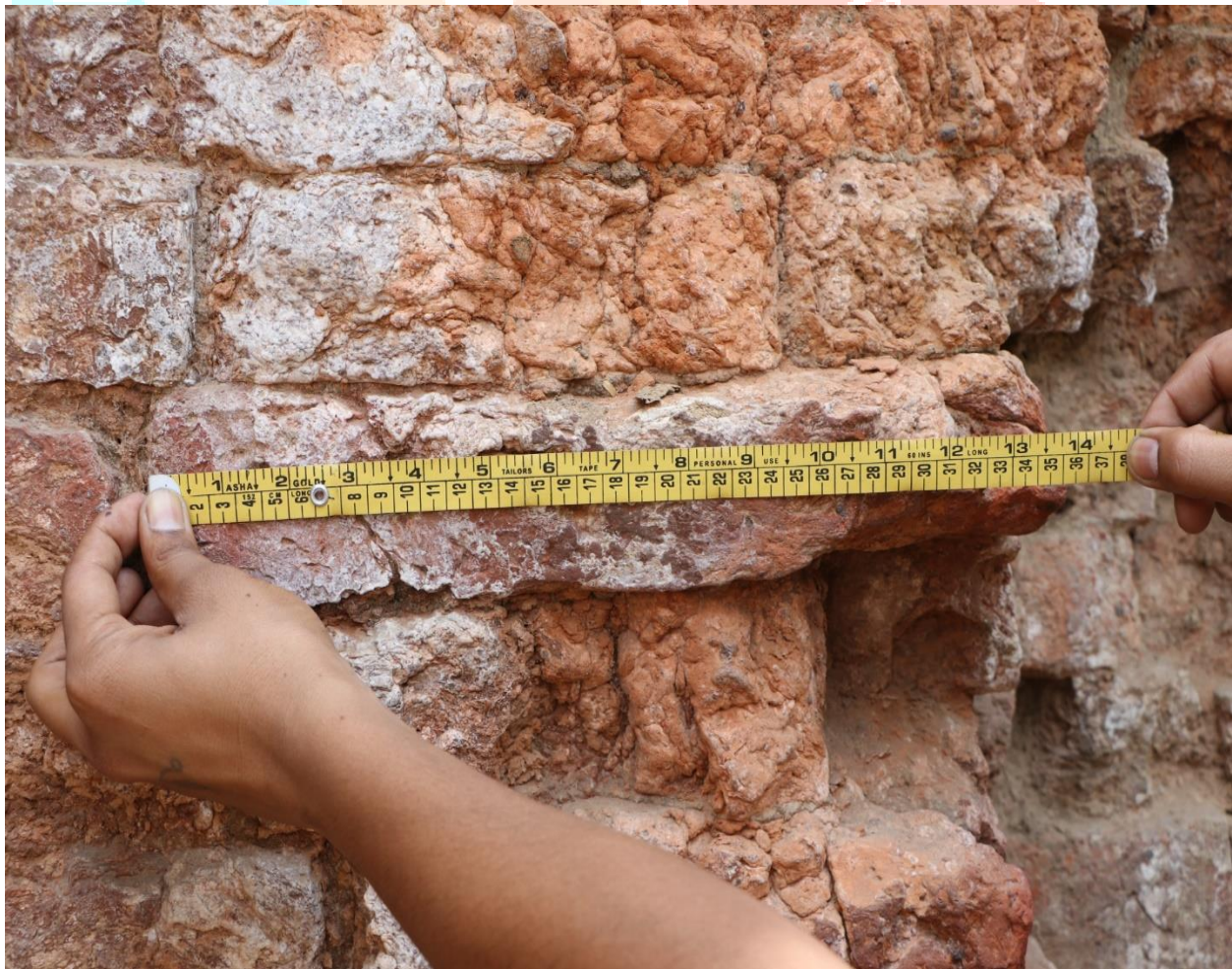
fig-1, size of bricks in stupa at western part of stupa mound no.PRL-1

The mound named as mentioned earlier is about 25 to 28 meters high from the surrounding flat place. Nagar Kheda is also situated here. On which even today a large population of the village is living. The north-eastern and north-western part of this mound have been cut according to their needs and residential used by the people. Due to this erosion, we can see the structures of Kushan period bricks. In the north-western part of the mound the remains of Buddhist Stupa made by big bricks of Kushan period are clearly visible. The size of the bricks used in the Stupa approximately 36X22X6cm (fig-1)