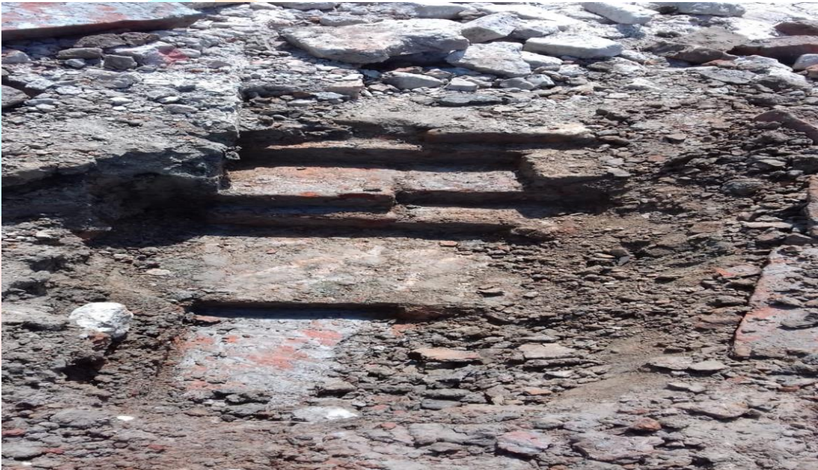
Brick Structures exposed at mound no. PRL-3