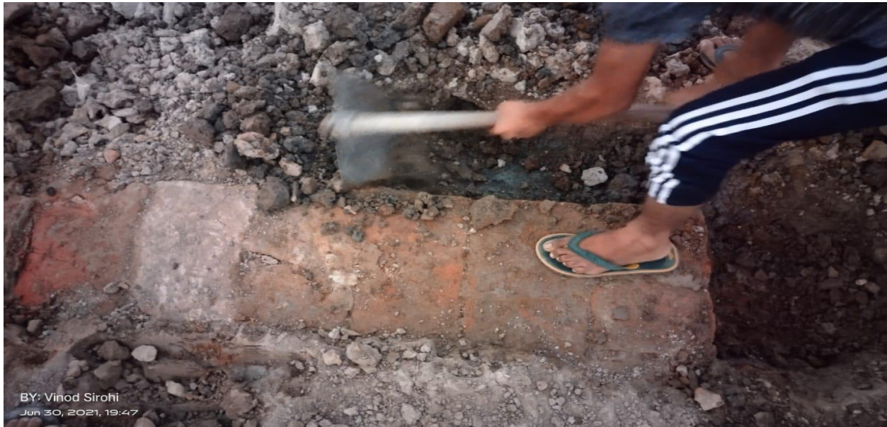
Fig-4, brunt bricks wall spread at mound no.PRL-3