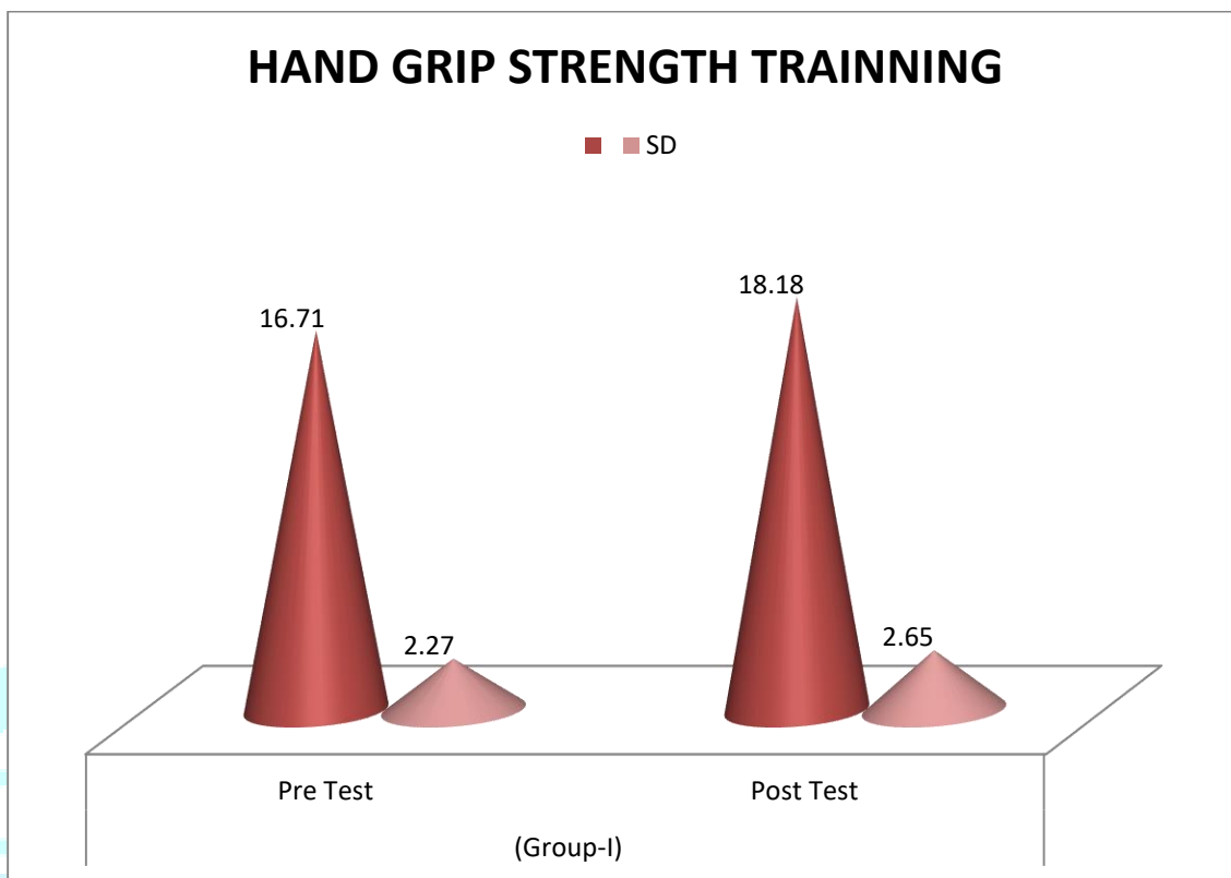
Fig. 1 The graphical representation of comparison of mean and SD of pre test and post test scores on throwing ball velocity of GROUP -1 Cricket Players

Fig. 1 The graphical representation of mean and SD of pre test and post test scores on throwing ball velocity of GROUP -1 Cricket Players