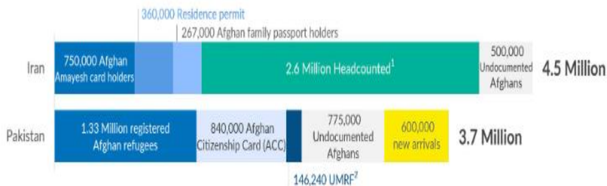
1 Fig.1 the total number of afghan refugees in Iran and Pakistan