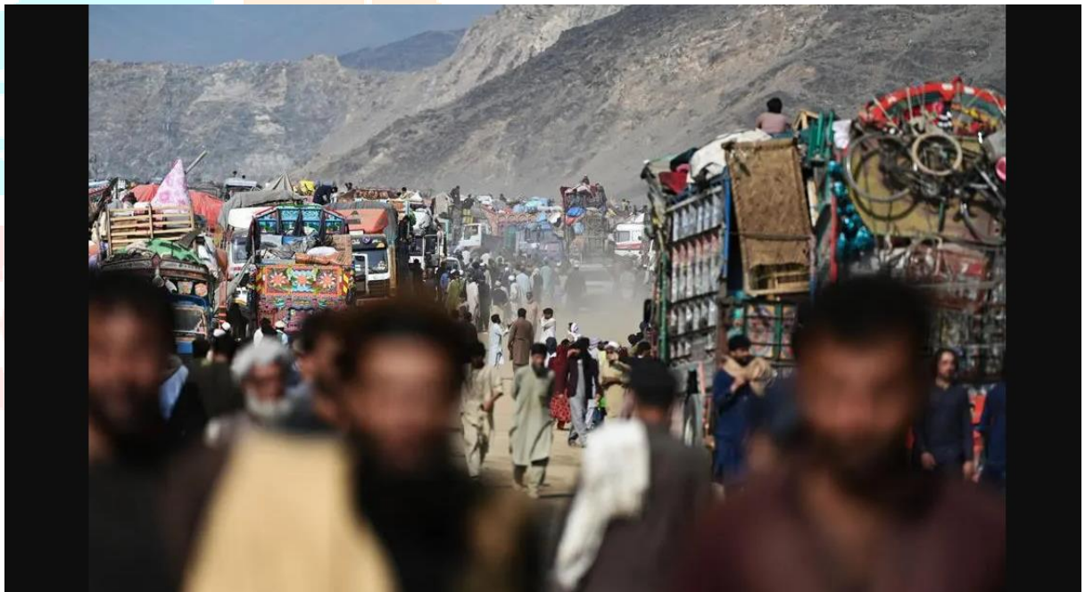
Afghanistan and Pakistan borders

The difficult talks that may take place between Afghanistan, Pakistan, and the UN High Commissioner for Refugees (UNHCR) are highlighted by the uncertainty surrounding the renewal of cardholders' status. The way this scenario is developing raises worries about the humanitarian ramifications and possible difficulties in finding a middle ground between protecting vulnerable communities and national security considerations.