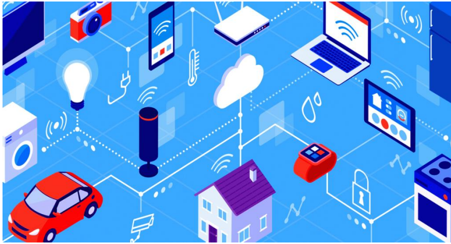
Fig 2: IoT supported devices which are connected and used for different applications