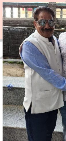
Fashion innovator (age group between 20-25 years)