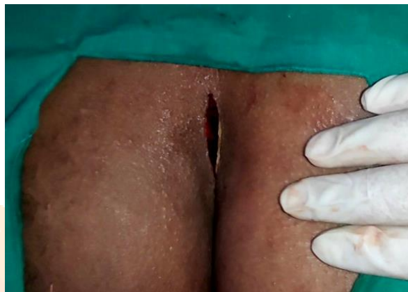
Elliptical incision taken