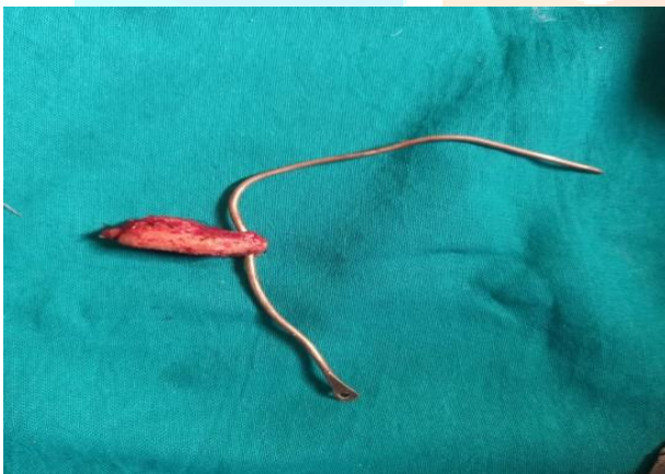
Excised sinus tract