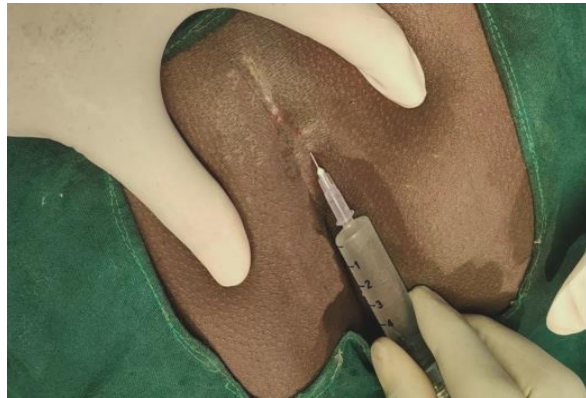
Infiltration of local anesthesia