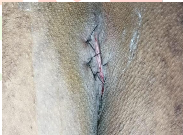
Wound closure using suturing