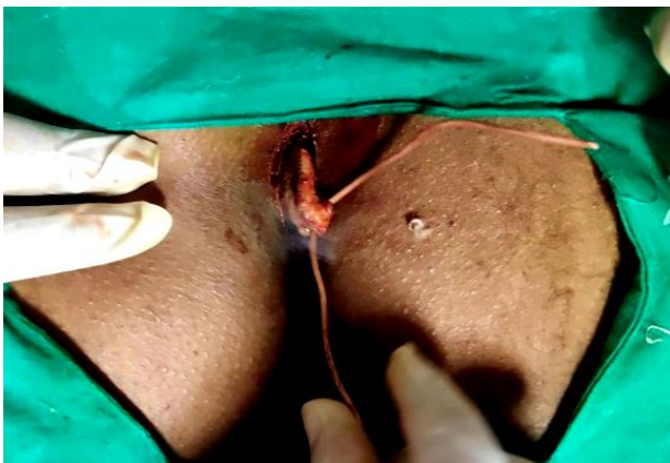
Excision of the traced sinus tract