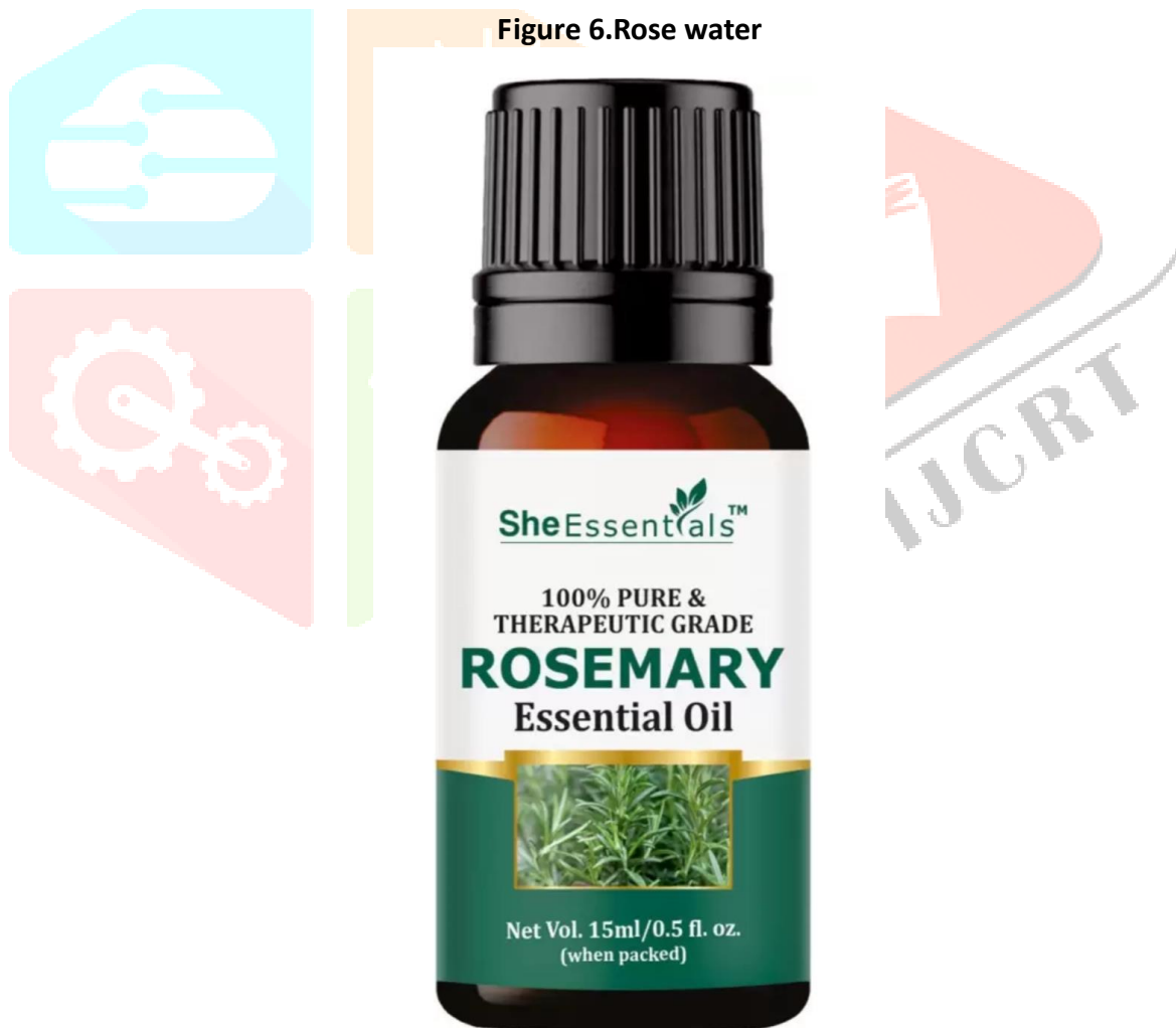
Figure 7. Rosemary essential oil