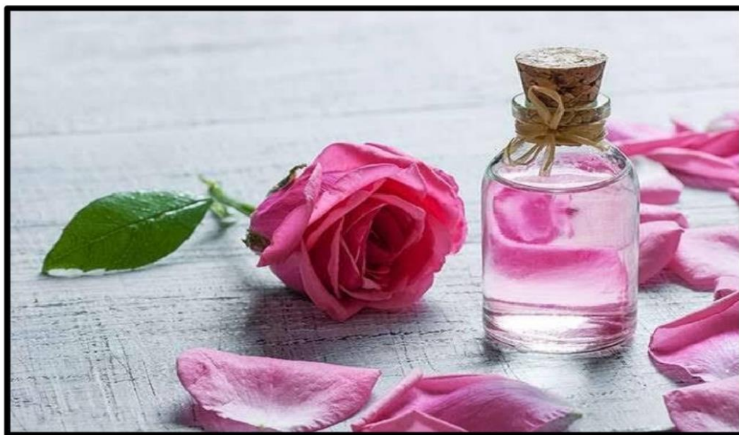
Figure 6. Rose water