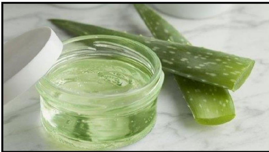
Figure 5.Aloe Vera

Also, Banyan tree arial roots powder, Aloe Vera gel, Rose water, Rosemary essential oil. (1)(2)