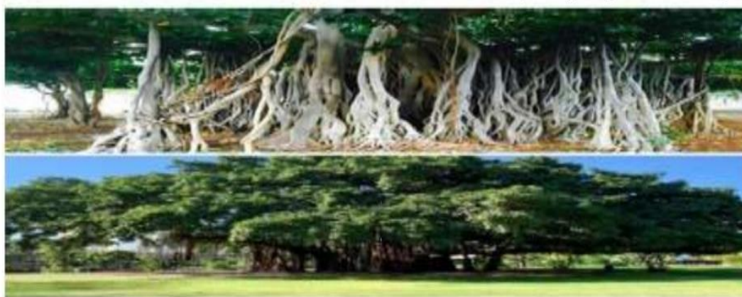
Fig: Banyan Tree

assessment, roots of Ficus bengali , and hair serum, phytosterols.