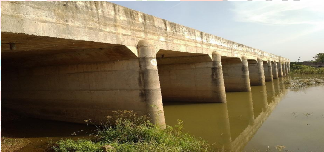
Figure-1: Bridges in the project stretch

Concrete spalling observed in bridges at underside of the deck slab, honey combing & voids observed in the girders, piers, abutments and damages observed in the expansion joints as well.