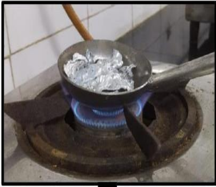
Melting of Yashada using Palika Yantra