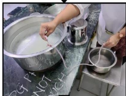
Filtration of Lime Water After 9Hrs