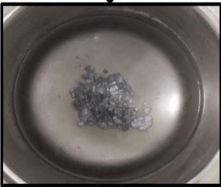
Solidified Yashada in Churnodaka