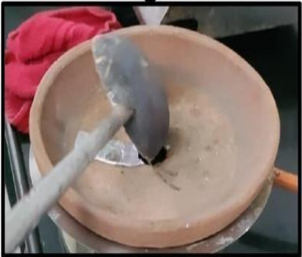
Melted Yashada quenched through Pithara Yantra in vessel containing Churnodaka for 7 times