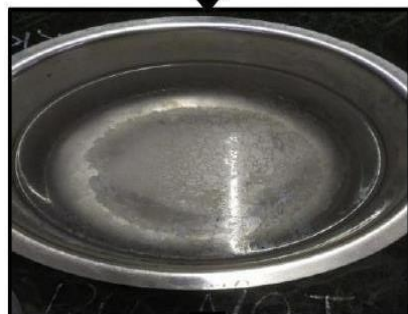
Lime Water Kept Aside for 9Hrs