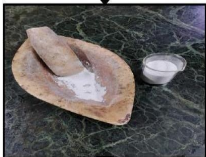
Converted to Lime Powder