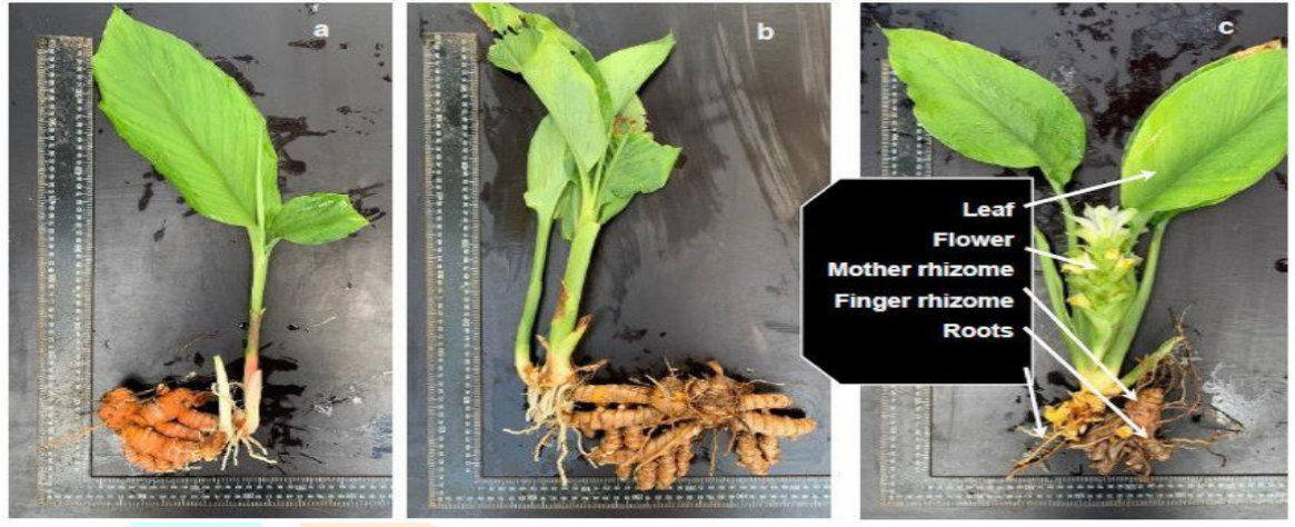
Figure 1. Curcuma Longa (Turmeric) Plant