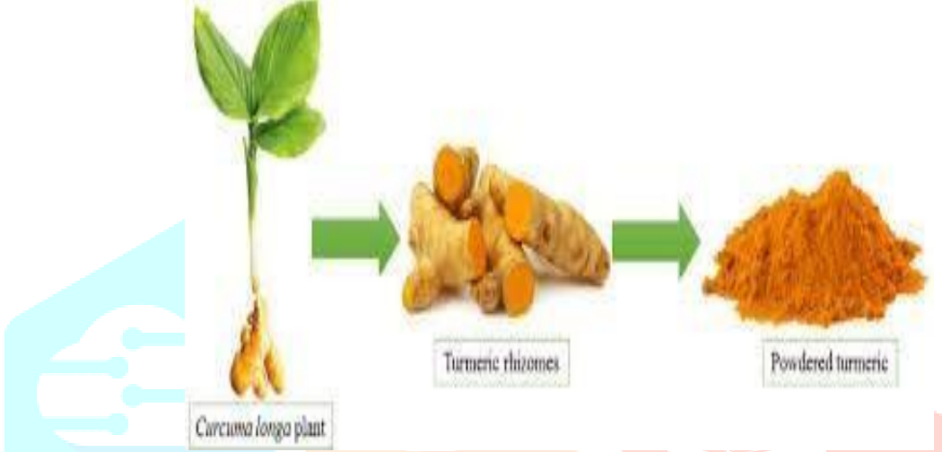
rhizomes (long turmeric) are simple or sparingly branching, elongated, and 0.5–1.5 cm thick. Figure 2. Turmeric Rhizomes and Powder

1.5 Microscopic characters: The main rhizome (round turmeric) is up to 4 cm long and 3 cm thick, with an ovate or pear-shaped shape (Fig. 2.). The lower section is distinguished by secondary rhizomes and roots scars, while the upper part is supported by leaf scars. It is cut into pieces before drying. The secondary