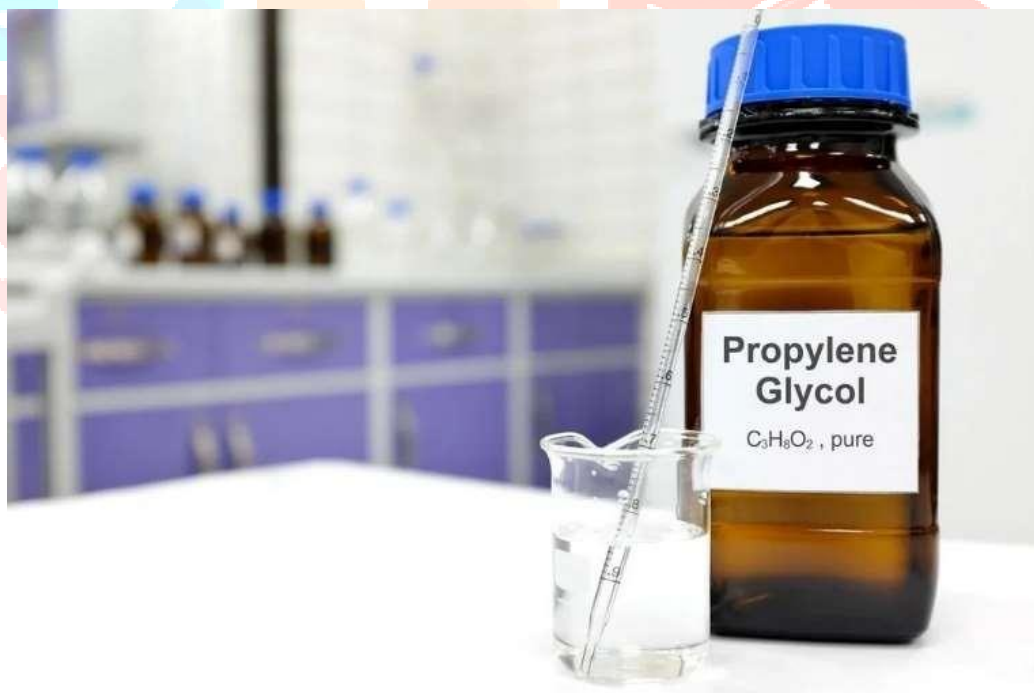
Fig No. 11 : Propylene Glycol

Propylene glycol is a common ingredient found in many cosmetic and personal care products, including lipstick. In lipstick, propylene glycol is primarily used as a moisturizing agent and a solvent. It helps to keep the lipstick formula soft and smooth, making it easier to apply and providing a creamy texture. Propylene glycol also helps prevent the lipstick from drying out and enhances its ability to retain moisture, which can be beneficial for the lips.