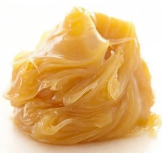
Fig No. 6 : Lanolin

Lanolin is a natural substance that is commonly used in various skincare and cosmetic products, including lipsticks. Lanolin acts as an emollient, which means it helps to moisturize and protect the skin. In lipstick, lanolin is often included as an ingredient to provide hydration and to prevent the lips from drying out.