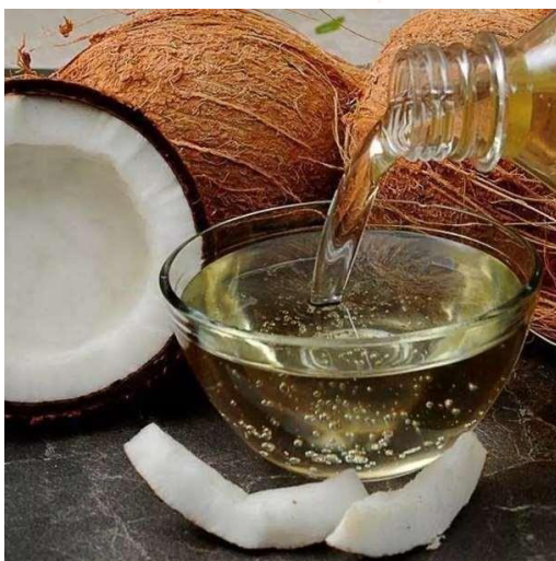
Fig No. 9 : Coconut Oil

This oil is obtained from the dried solid part of the endosperm of the coconut - Cocos nucifera , family Palmae. It is a white or pearl-white unctuous mass in winter and colourless in summer.