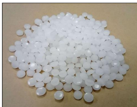
Fig No. 3 : Paraffin Wax

It is derived by the distillation of petroleum. It is a mixture of solid hydrocarbons consisting mainly of n-paraffins and, to some extent, their isomers. So, it is also called hard paraffin wax. Physically, the paraffin wax is colourless, odourless or a white, translucent, wax-like solid, which is slightly greasy to touch. Paraffin wax melts at 50°C-57°C.