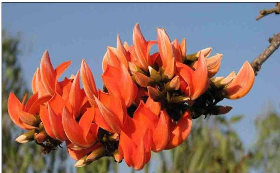
Fig No. 1 : Butea Monosperma Flower

Synonyms : Palash flower, Butea Gum tree, Tesu, Suparni, Paladulu.