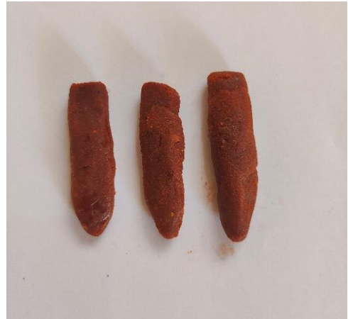
Fig No. 17 : Formulation 4