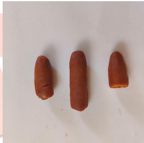
Fig No. 19 : Formulation 6