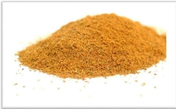
Fig No. 5 : Butea Monosperma

Butea monosperma contains a natural pigment called "butein" that is responsible for its vibrant orange-red color. Butein is a flavonoid, which is a type of plant compound known for its antioxidant and pigmentation properties. It is used as a natural dye and colorant in various industries, including textiles and cosmetics.