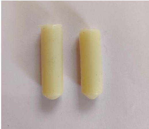
Fig No. 16 : Formulation 3