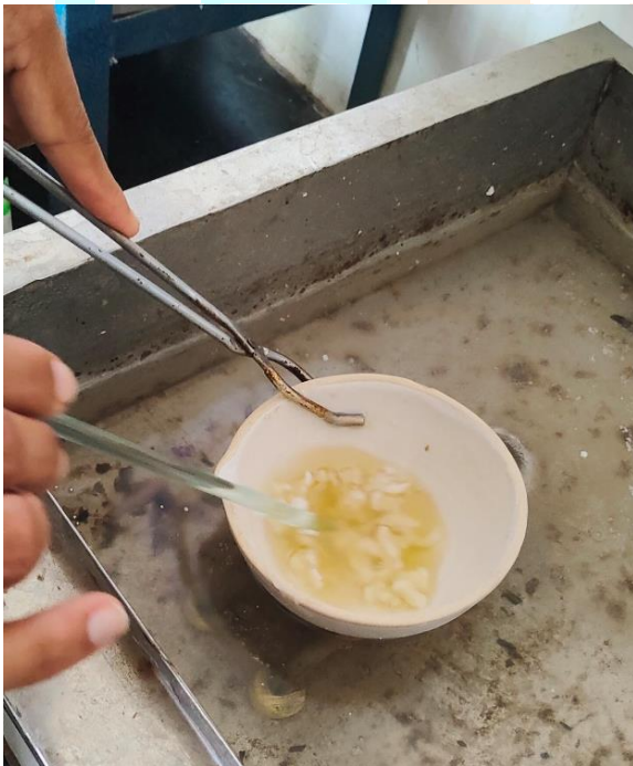
Fig No. 12 : Formulation Base