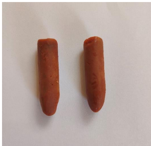
Fig No. 20 : Formulation 7