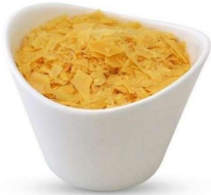
Fig No. 4 : Carnauba Wax

This is obtained from the leaves of the Brazilian wax palm, Copernicacerifera , which belongs to the Palmae family. Carnauba wax is available in various grades. The highest grade is light-brown to pale-yellow in colour. It is in the form of moderately coarse powder or flakes, with a characteristic bland odour. The melting range of this wax is 81°C -86°C. It is a hard wax and is used in the manufacture of candles, wax varnishes, leather and furniture polishes.