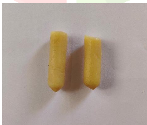
Fig No. 14 : Formulation 1