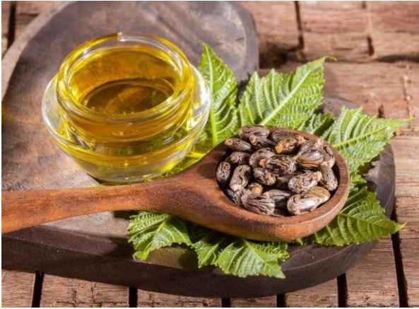
Fig No. 7 : Castor Oil

Oil is obtained from the seeds of Ricinus communis belonging to the family, Euphorbiaceae. It has a slight odour; the oil is either yellow in colour or colourless. It consists of a mixture of glycosides, in which 80% of ricinoleic acid is the major constituent. At 0° C it forms a clear liquid. It is used as an emollient, in the preparation of lipsticks, hair oils, creams and lotions.