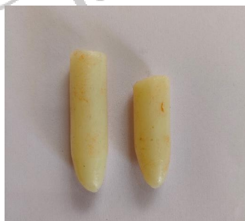
Fig No. 15 : Formulation 2