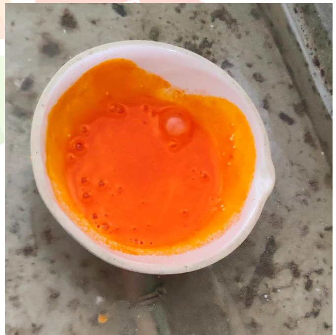
Fig No. 13 : Formulation with Pigment