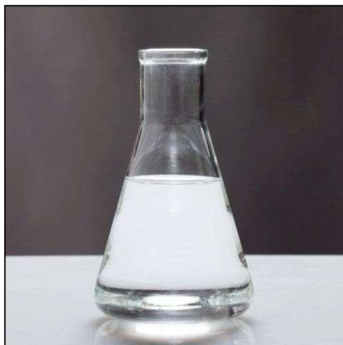
Fig No. 10 : Isopropyl Myristate

Isopropyl myristate is a commonly used ingredient in cosmetics, including lipstick. It acts as an emollient, which means it helps to soften and soothe the skin. Isopropylmyristate can help to moisturize and condition the lips, preventing them from becoming dry or chapped.