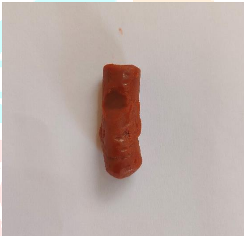
Fig No. 18 : Formulation 5