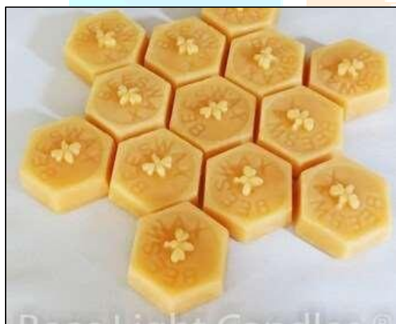
Fig No. 2 : Bees Wax

It is a purified wax separated from the honeycomb of bees, Apis mellifera which belong to the Family, Apidae . Beeswax is composed of 70% ester myricylpalmitate. It is yellowish brown in colour, solid, with a honey-like odour. Under cold conditions it becomes brittle; when bleached, it becomes yellowishwhite solid with a faint characteristic odour. The melting point of beeswax is 62°C-65°C. Beeswax helps in the incorporation of water to form an emulsion.