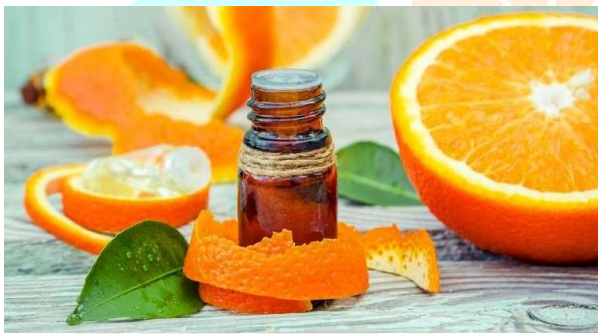
Fig No. 8 : Orange Oil

Orange oil is a natural ingredient commonly used in cosmetics, including lipsticks. It is derived from the peel of oranges and is known for its pleasant citrus scent.