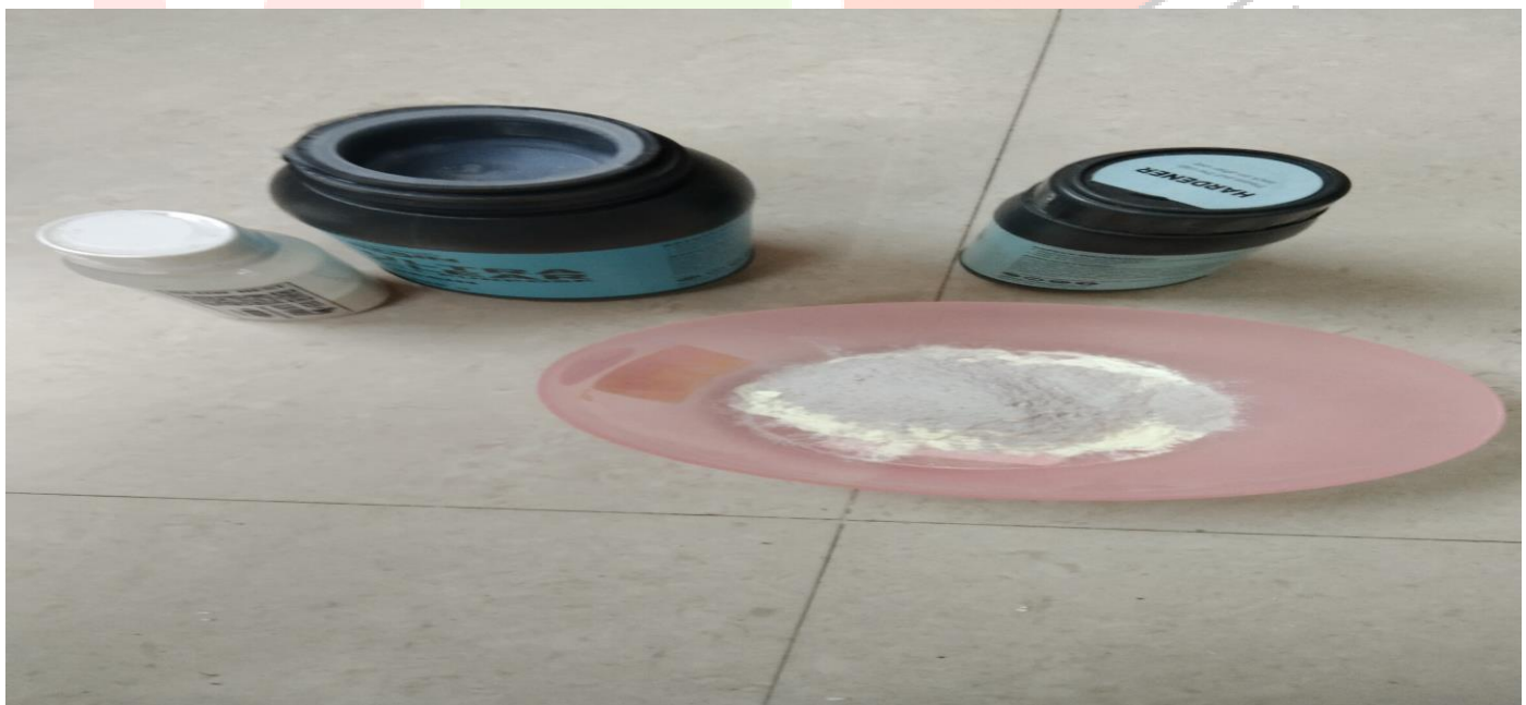
Figure 1 Ingredients of Photoluminescent Coating Clear Resin, Strontium aluminate, Glass Powder