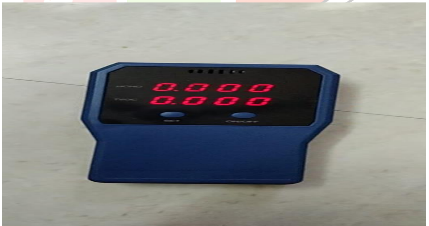
Figure 3 Air Quality meter test on Photoluminescent Coating