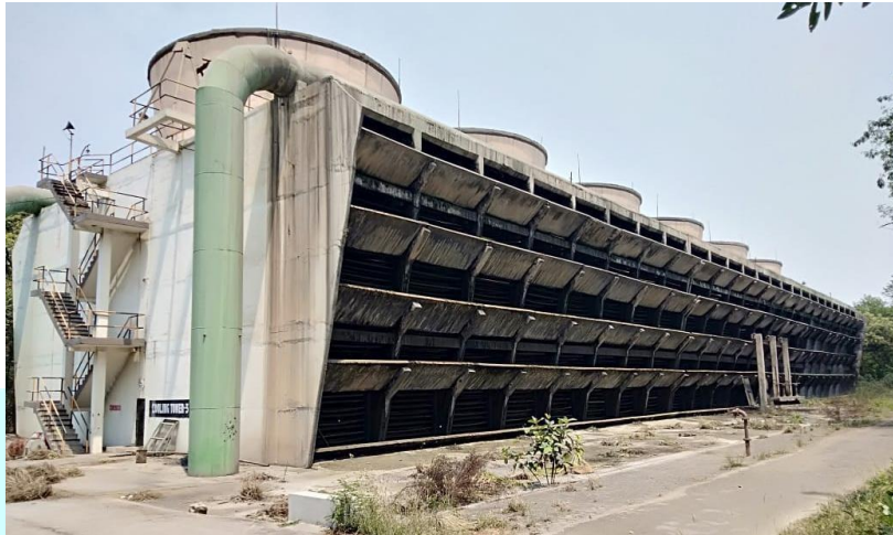
Figure-1 : Initial Condition of cooling tower

Due to continuous exposure to the moisture and due to the surrounding environmental conditions, at many locations the concrete got spalled and reinforcement got corroded & exposed.