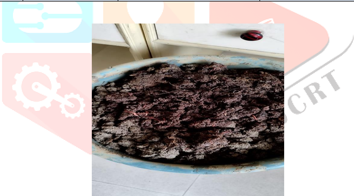
Fig.A. Laboratory culture of the epigeic earthworm Eisenia fetida (the red worm)