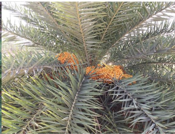
Phoenix Sylvestris (L.) Roxb.