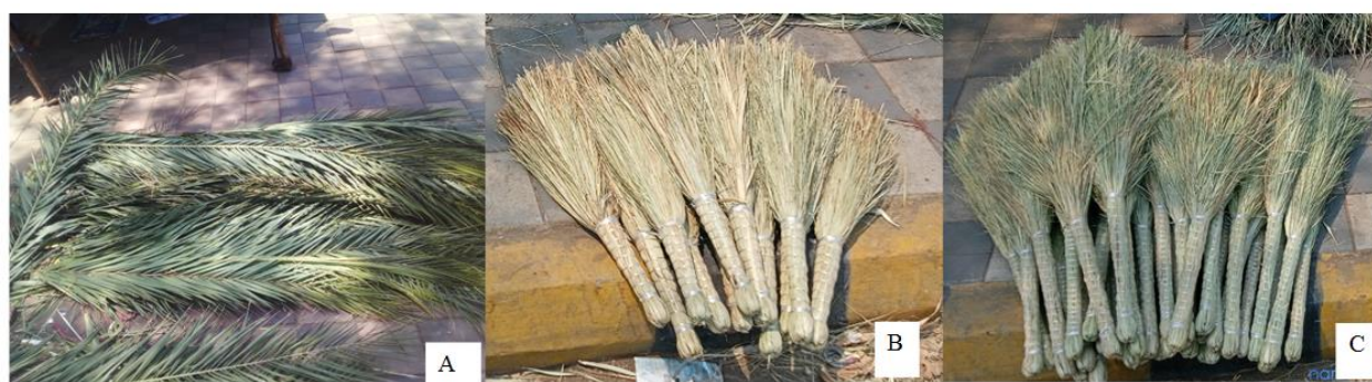
A. Leaves of Phoenix sylvestris B. Broom ( P. sylvestris ), C. Broom ( P. acaulis )