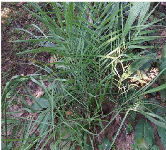
Phoenix acaulis Roxb