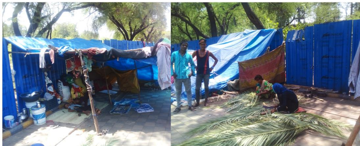
Temporary Hut and work place of Broom Makers

Broom preparation and selling door to door is the occupation of broom makers who belonging to Bilah block of Bilaspur district of Chhattisgarh State. At Nagpur region several families living at different places such as Ambazari T point, Jaitala, Rajunagar, wad-dhamna, Ittabhatti, Naka No. 5, Tolanakka, Dighori etc. Table 1 shows no. family and family member living in temporarily prepared huts.