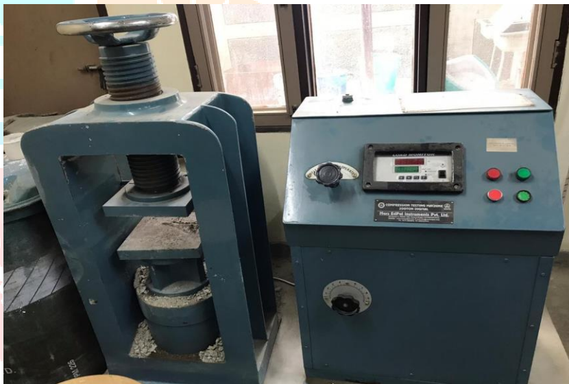
Figure 1: Compressive strength testing machine

Compressive strength is the important mechanical property that used to give characteristic compressive strength of concrete. Compressive strength for all concrete samples are done as per Indian Standard Specifications BIS: 516–1959. Furthermore, the cube sizes in this are kept as 150mm×150mm×150mm and the test was evaluated at the curing age of 7 days, 28 days and 56 days. Concrete samples were kept demolded for 24 hours and after casting, the concrete samples were placed in curing tanks for required curing age. Then after each curing age the samples were taken out and then the testing was done in CTM by applying specified load rate i.e. 140 kg/cm 2 /min. Then the load of the machine was increased until the concrete specimens do not break, and the maximum amount of load was taken and noted down of concrete specimens.