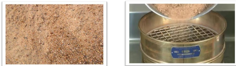
Fig 2 Fine Aggregate