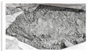
Fig 1 Cement

Ordinary Portland Cement of 53 Grade cement - conforming to IS: 12269-1987 : Ordinary Portland Cement of 53 Grade of brand name Bharathi Cement Company, available in the local market was used for the investigation. Care has been taken to see that the procurement was made from single batching in air tight containers to prevent it from being affected by atmospheric conditions. The cement thus procured was tested for physical requirements.