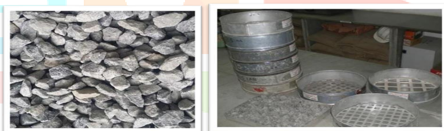
Fig 3 Coarse Aggregate