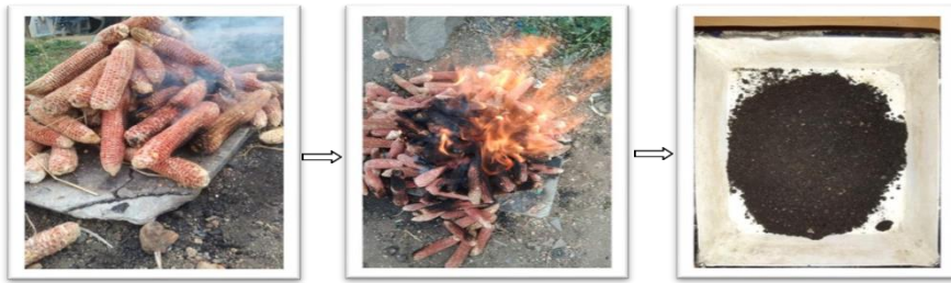
Fig 5 Corn cob ash

through an Indian standard sieve of 90 \mu m. The portion passing through the sieve is the resultant corn cob ash.