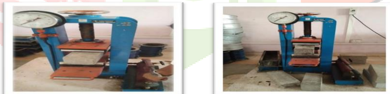
Fig 11 Flexural strength test