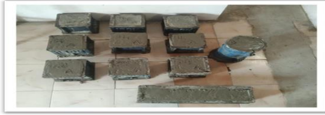
Fig 7 Casting of concrete