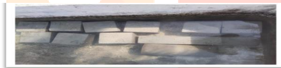
Fig 9 Curing of Concrete