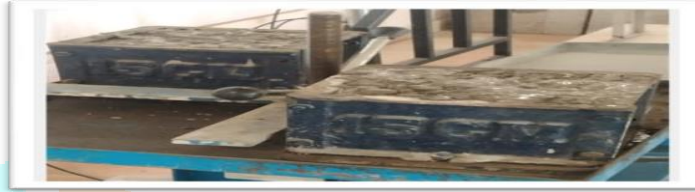
Fig 8 Compaction of concrete