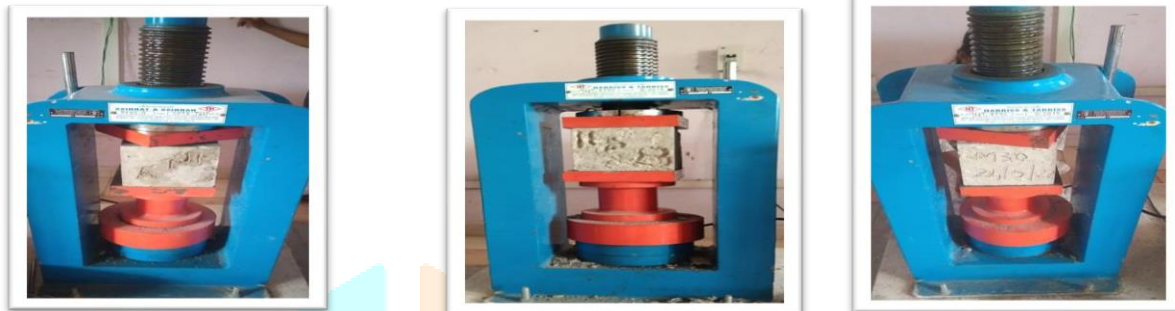
Fig 10 Compressive Strength Test

Calculations Format ; Size of the cube =150mm x 150mm x 150mm Area of the specimen =22500mm 2 Compressive strength = (Load in N/ Area in mm 2 ) [N/mm 2 ]