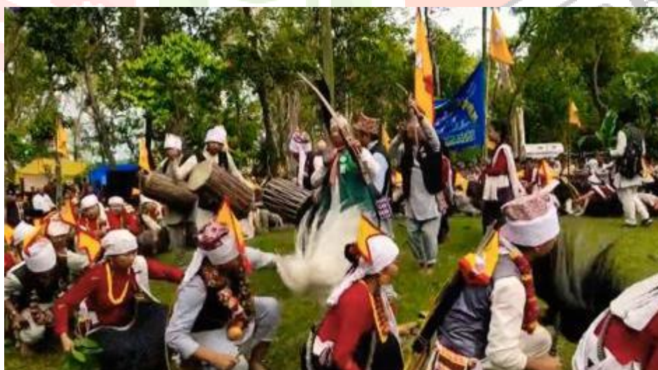
Sakela celebration among the kiratis of different regions