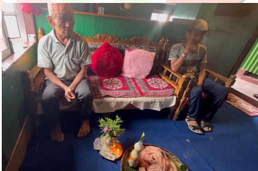
Tribute to Phedangba at the end of entire ritual.

Influence of global culture upon the youth is accelerating the process further. The fantasies and sparkling modern day lifestyle does not stop them from going against their ethnic beliefs. They hardly pay gratitude for the natural resources around, hardly pays homage to ancestors or asks for forgiveness.