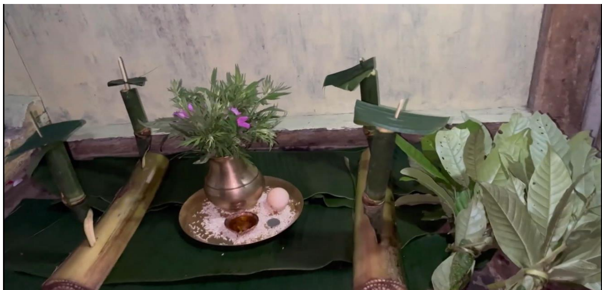
puja ko thana (freshly prepared place for worship showing all the required natural objects)