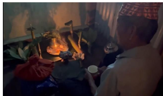
Pictures from the ritual mentioned in the text. Phedangba worshipping in the pitri kotha, elderlies preparing chongey and members of the house dragging the slaughtered animal.