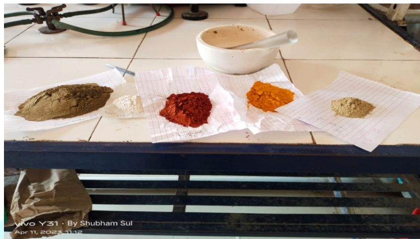
Fig 3. Raw material

Cassia tora leaves was preferred it is economical and have an medical importance. The leaves of cassia tora were collected from pune market and also lal chandan, haldi, elachi, are also purchase from local market of pune.