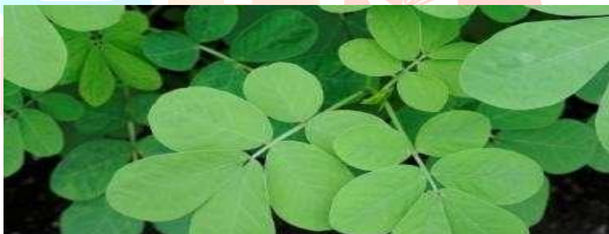
Fig 1; - leaves

The primary compounds found in the leaves were flavonoids and anthraquinone glycosides. In the anthraquinone glycoside, there are rhein, emodine, Obtusifolin, physion, chrysophanol, chrysoobtusin, chryso-obtusin-2-O--D-glucoside, and obtusifolin-2-O--D-glucoside 3, 4 . Sennosides, which are well known for their therapeutic value, have been found in the plant's leaves. Sennoside content was determined to be 0.145% in the leaves of C. tora .It has also been claimed that leaves contain the flavonol glycoside kaempferol-3- diglucoside. Ononitol monohydrate, a possible hepatoprotective component, was found in the leaves of C. tora .