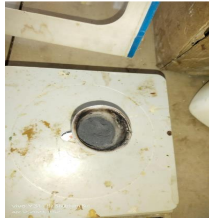
fig no 8. Ash