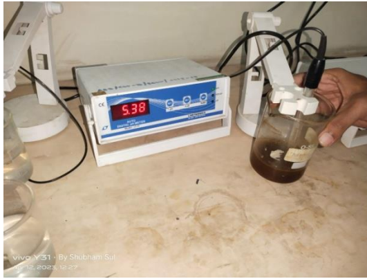
Fig no7. Ph