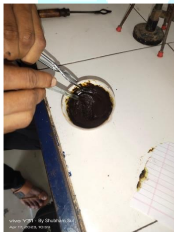
Fig no 5. Lep cream

Using 85 mesh the powdered ingredient were sieved and accurately weighed, then mixed geometrically to ensure even mixing. In order to evaluate it, the product was placed in an airtight container. Lep cream is prepared by mixing powder with cream base (Ghee) in desired consistency of making soft cream. The prepared mixture was then placed in the refrigerator overnight before application.