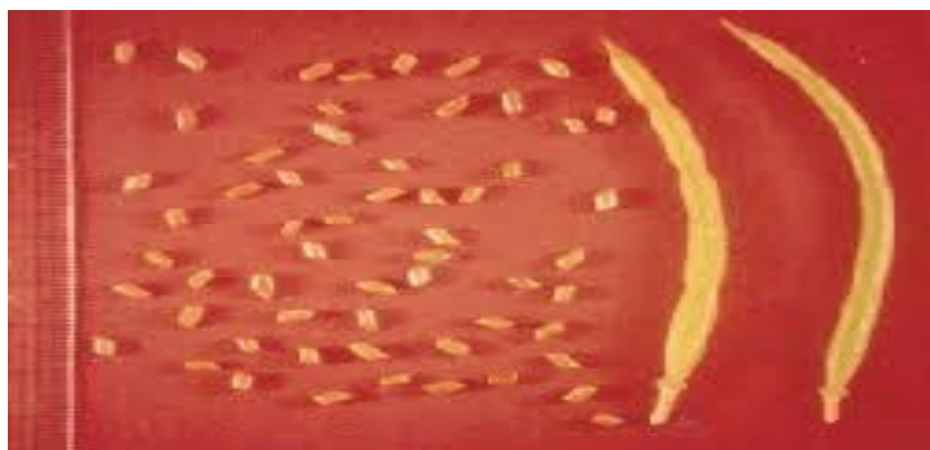
FIG. 2 : CASSIA TORA SEEDS AND PODS