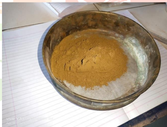
fig no 6. Powder