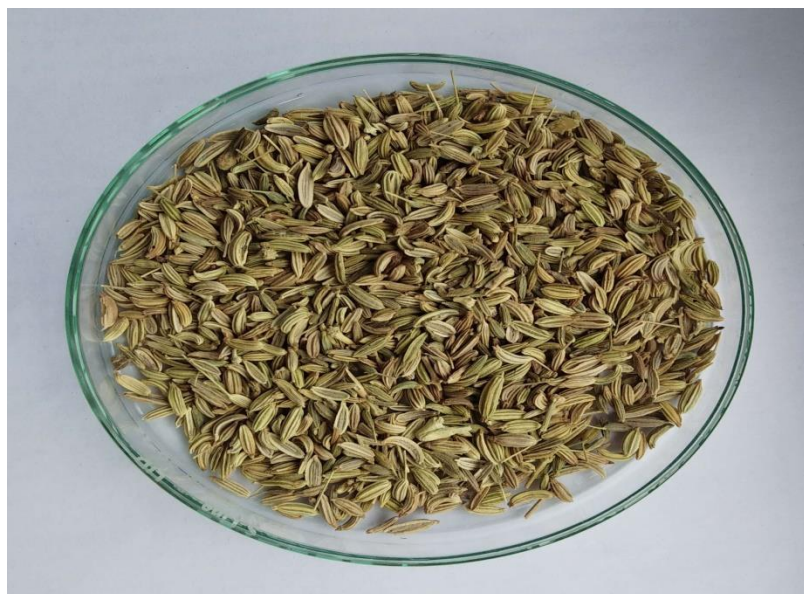
Fig: Bādiyān ( Foeniculumvulgare Mill.)

Macroscopic: Entirely fruits are attached with pedicle, mericarps, up to around up to around 100mm long and 4mm wide, five sided with a broader commissural surface, tapering slightly towards base and apex, capped with a conical stylopod, glabrous, greenish or yellowish-brown with five paler prominent main ridges; endosperm; orthospermous [7].