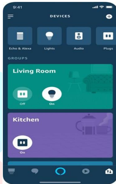
fig.3 Alexa Home Screen

Amazon Alexa, also known simply as Alexa, is a virtual assistant technology largely based on a Polish speech synthesizer named Ivana, bought by Amazon in 2013. It was first used in the Amazon Echo smart speaker and the Echo Dot, Echo Studio, and Amazon Tap speakers developed by Amazon Lab126. It is capable of voice interaction, music playback, making to-do lists, setting alarms, streaming podcasts, playing audiobooks, and providing weather, traffic, sports, and other real-time information, such as news. Alexa can also control several smart devices using itself as a home automation system. Users are able to extend the Alexa capabilities by installing "skills" (additional functionality developed by third-party vendors, in other settings more commonly called apps) such as weather programs and audio features. It uses automatic speech recognition, natural language processing, and other forms of weak AI to perform these tasks.