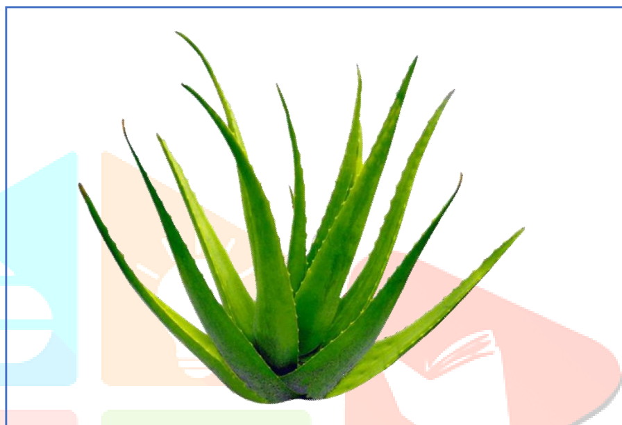
Fig no 2: Aloe vera ( Aloe barbadensis ) Scientific Classification Of Aloe vera :