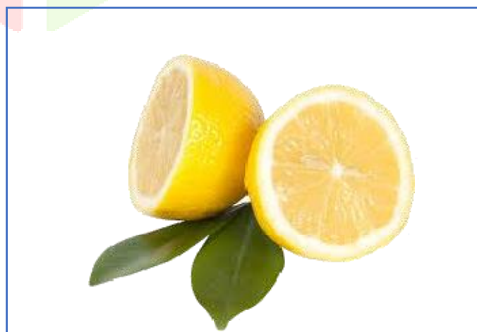
Fig no 3 : Citrus Lemon ( Citrus Limonis ) Scientific Classification Of Citrus Lemon: