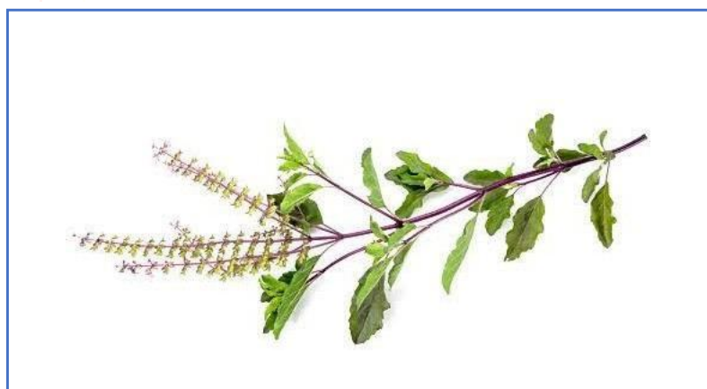
Fig no 1: tulsi ( Ocimum sanctum )