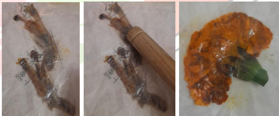
Fig. 2 Pounding of flowers

The mordent treated fabric is dried in the shade and it is ironed. marigold and banana flower the fabric is placed on top of the thick sheet. Then the fabric is separated into two parts. One part of the fabric is printed with a banana flower and another part is a printer by a marigold flower and its petal.