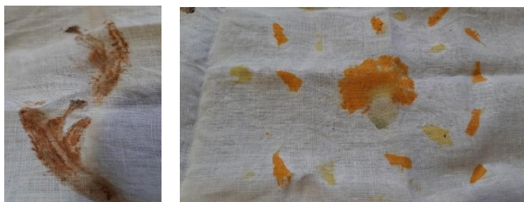
Fig. 3 Pounding of Flower Print After Printing