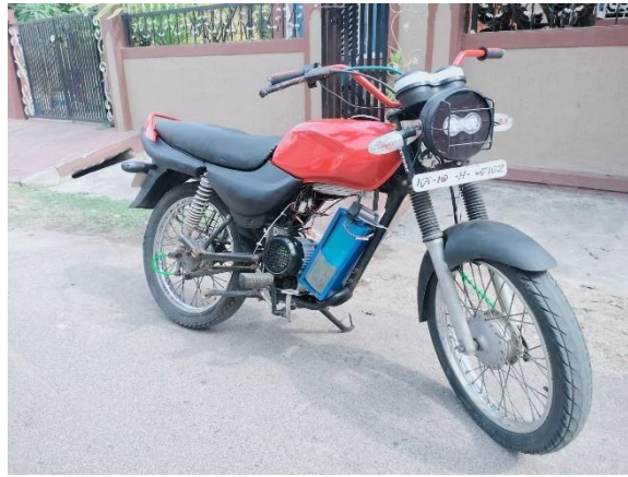
Fig 2: EV Mithra