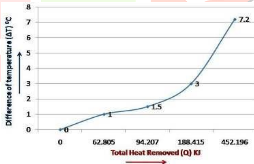
Fig.2 Heat Removed from Water (KJ) and Cooling Effect Obtain ( ^{\circ}C )

Fig. 2 shows the heat removed from the water at each observation with the mentioned component arrangement and corresponding cooling effect obtained. Here the cooling effect obtained is equal to the heat removed.