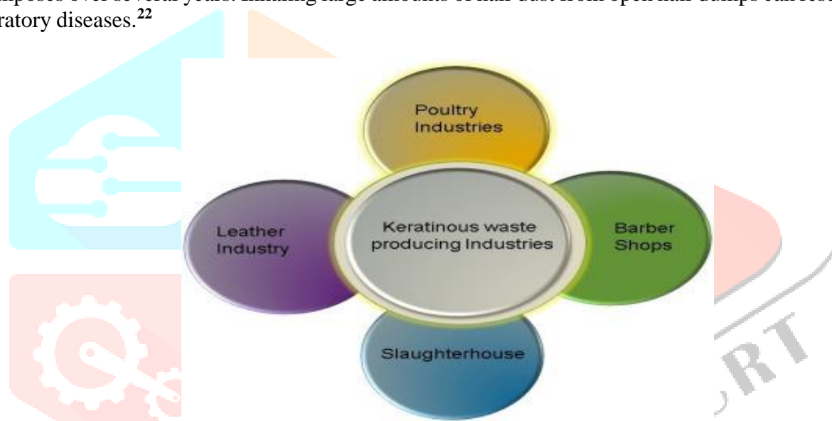
Figure 2. Keratin waste producing industries

Keratin pollution is also generated by barber shops and hair dressers. Human hair is considered to be an environmental pollutant all over the world, and it is found in municipal waste. 21 In cities, hair is often deposited as solid waste, clogging drainage systems. In rural areas, hair is thrown into nature where it slowly decomposes over several years. Inhaling large amounts of hair dust from open hair dumps can result in several respiratory diseases. 22