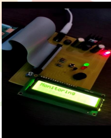
Fig 2. Monitoring