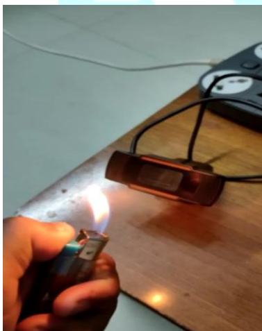
Fig 1. Fire Detection by Camera

The proposed method was implemented using Raspberry Pi 2[5], OpenCV 3 and python3.4.