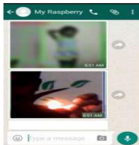
Fig.4 MMS Displayed via WhatsApp