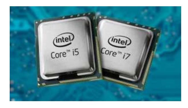
A system contain i5/i7 processor

The Intel processor i5/i7 is a central processing unit (CPU) that is commonly used in personal computers and is known for its high processing power. In the proposed system of gesture-based tool for sterile browsing of radiology images, the i5/i7 processor is used to accurately predict the gestures made by the user. The processor is responsible for handling the complex computations required for detecting and interpreting the gestures made by the user. It is known for its advanced features such as hyper-threading and turbo boost technology, which enable it to handle multiple tasks simultaneously and enhance its clock speed, respectively. These features make the processor ideal for accurately predicting the gestures made by the user, which is critical for ensuring the smooth and efficient operation of the system. It is also equipped with Intel's Advanced Vector Extensions (AVX) instruction set, which allows it to handle complex data-intensive tasks efficiently. This feature is particularly useful in the proposed system as it enables the processor to process and analyse large amounts of image data in real-time, which is critical for accurately predicting the gestures made by the user.