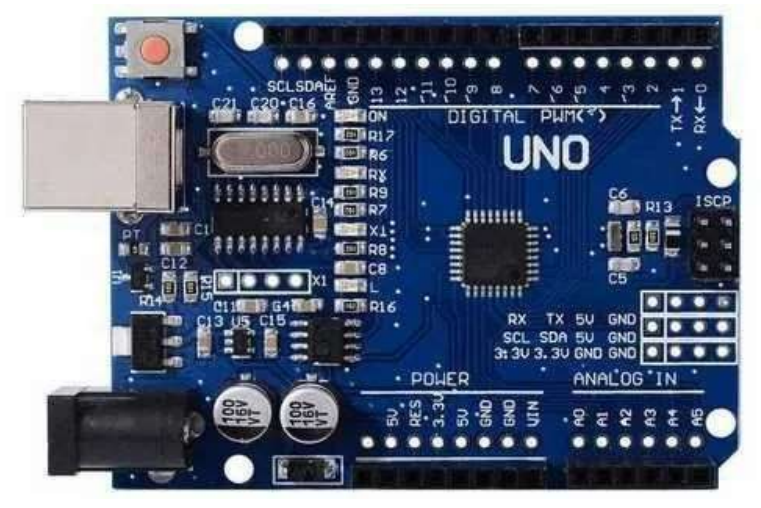
Fig.1 Arduino Uno.

An Arduino module is a small, low-cost, programmable circuit board designed for use in electronics projects. It is based on a microcontroller, input/output pins, and a programming interface. The microcontroller is the main component of the module, responsible for processing data and controlling various components of the circuit. The input/output pins allow the module to communicate with other electronic devices and sensors, and the programming interface allows users to write and upload code to the module. Arduino modules are popular in hobbyist and educational settings, as well as in professional applications, due to their flexibility, ease of use, and low cost.