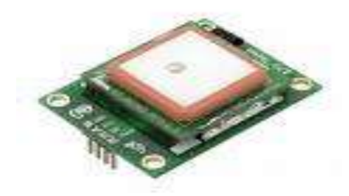
Fig.2 GPS Module

A GPS module is a device that receives signals from multiple satellites orbiting the Earth and uses those signals to determine its own precise location, as well as speed and direction of movement. It consists of a GPS receiver, an antenna, and a processing unit. The GPS receiver picks up signals from multiple satellites, and the processing unit calculates the user's precise location by triangulating the signals from the satellites. GPS modules are commonly used in