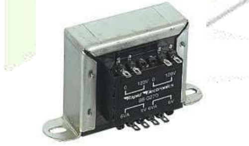
Fig.3 TRANSFORMER Module.

A transformer module is a type of electronic component that is used to transfer electrical energy from one circuit to another through electromagnetic induction. It consists of two coils of wire wrapped around a magnetic core, which allows for the transformation of voltage levels between circuits. The module is commonly used in power supply circuits and electrical systems.