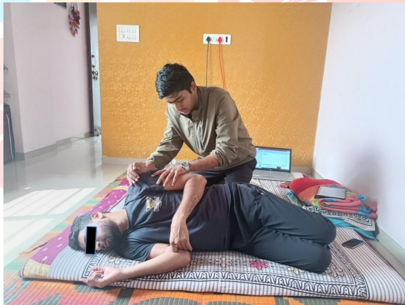
Figure 2: Resistance to Posterior Depression.