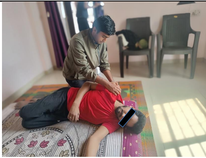
Figure 1: Resistance to Anterior Elevation