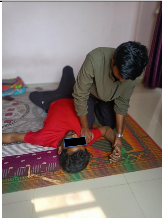
Figure 3: Pectoralis Stretching