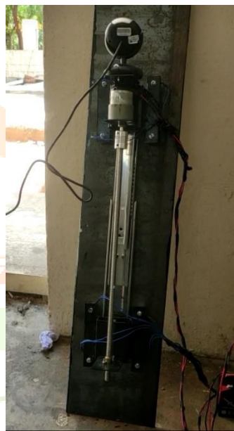
Fig (7) Expanded Condition

Larger ducts and chimneys are common piece of sight in most of thermal power plants, oil & gas, fertilizers, and other process industries. During maintenance / overhaling these ducts / chimneys are inspected manually, which is one of the time consuming and risky process as they are tall to climb or descend. During such inspections accidents also occurs hence the situation demands for equipment's which they themselves can climb and send visuals to inspection professionals.