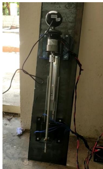
Fig (5) Climbing