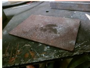
Figure 1. MS Plate 100mmx100mm.

Mild Steel is used to prepare the Shoulder plate and Hip plate.