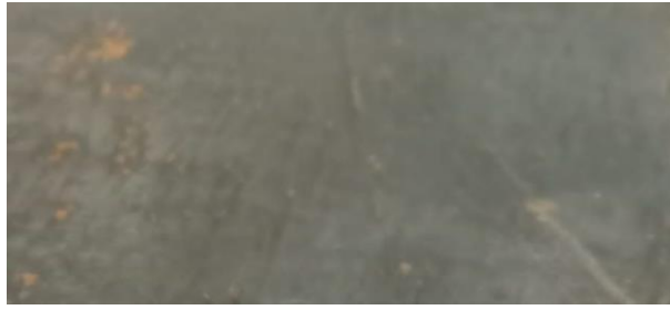
Fig (6) Metal Surface Camera Image 1