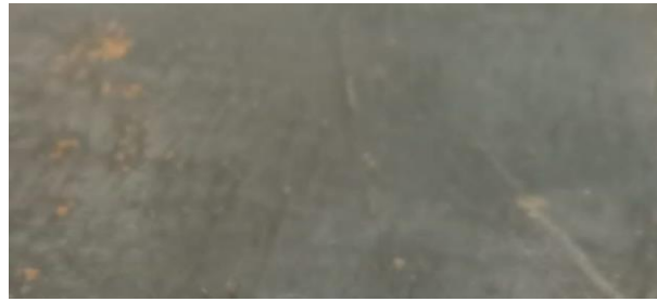
Fig (8) Visuals of Inspection

During tests it is observed that this climber is very easy to operate and can be easily adopted by inspection professionals. Visuals recorded by the linear electromagnetic climber are shown in Fig (8)