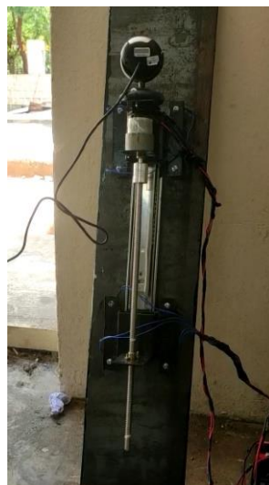
Fig (3) Fabrication and Assembly of Magnetic Climber

Linear Magnetic Climber is fabricated, and wiring is done to meet the requirements of the project