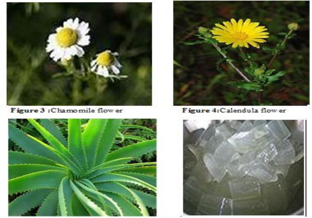
Figure 5: Alos vera plant and gel.

aid in the healing of wounds. <sup>[22]</sup> Internally, it is used as a dessert <sup>[23]</sup> to treat conditions including psoriasis, diabetes mellitus, hyperlipidemia, hepatitis, heartburn, indigestion, <sup>[24]</sup> and liver diseases like hepatitis. <sup>[28]</sup> Antibacterial and antifungal activities can be found in A. vera extracts. When treating eczema, its gel (Figure 5) is immediately administered to the affected areas. Antibacterial and antifungal activities can be found in A. vera extracts and antifungal activities can be found in A. vera extracts. Its gel (Figure 5) is immediately administered to the body regions with eczema. Its hydrating effects make the skin smoother and hasten the healing of wounds. Many people claim that their eczema symptoms, such as skin dryness and scaling, have decreased. Because of its antibacterial qualities, it also helps to prevent secondary infection. A. vera cream was compared to a placebo in a randomised, double-blind clinical trial with 60 patients who had mild to moderate persistent psoriasis. With A. vera cream, the cure rate was 83% compared to 7% with placebo. <sup>[29]</sup>