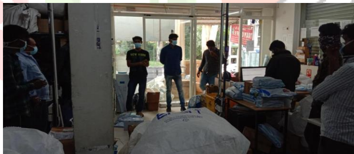
Figure 6 Training in trolley handling