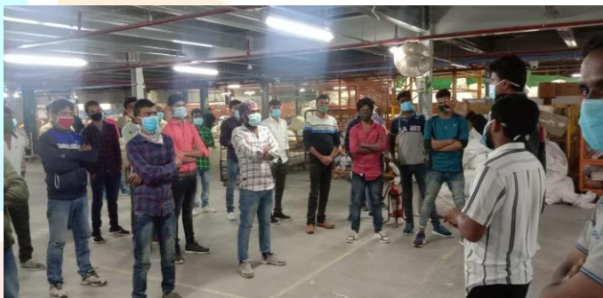
Figure 5 Consequences of at risk behaviour

Make sure the operator can safely load and unload the trolley (anything over 25 kg they'll need assistance – counting on the operator).