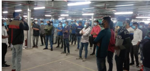
Figure 2 Important of behaviour based safety

Watch for narrow places when moving materials.