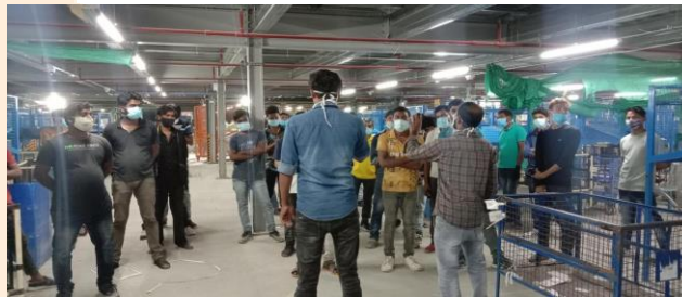
Figure 3 Training at manual material handling TEAM LIFTING

When the load is more than 20 kg, additional manpower is required.