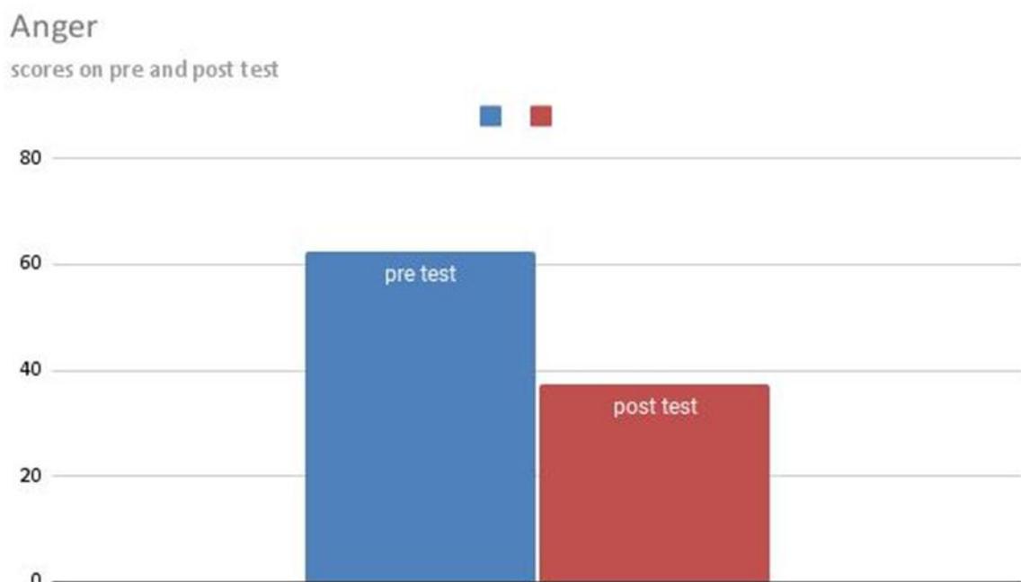
Figure 1: The Scores on Anger Control Scale in the Pre and Post Intervention stages.