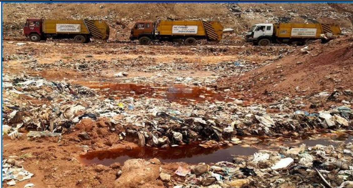
Effects of Soil Pollution