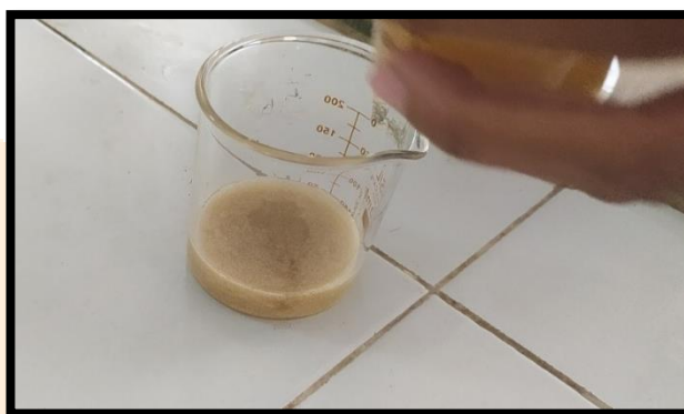
Figure no.15 Organoleptic Evaluation