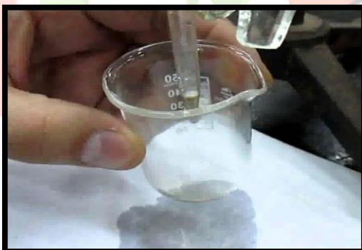
Figure no.18 Surface Tension Measurements by Using Stalagmometer