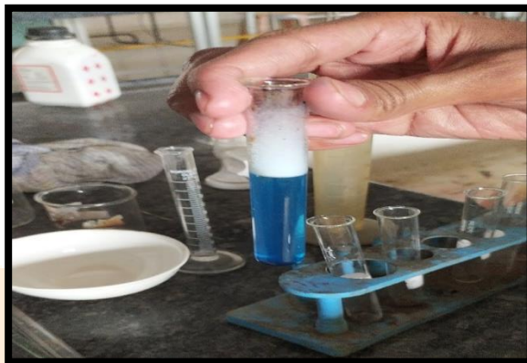
Figure no.19 Dirt Dispersion