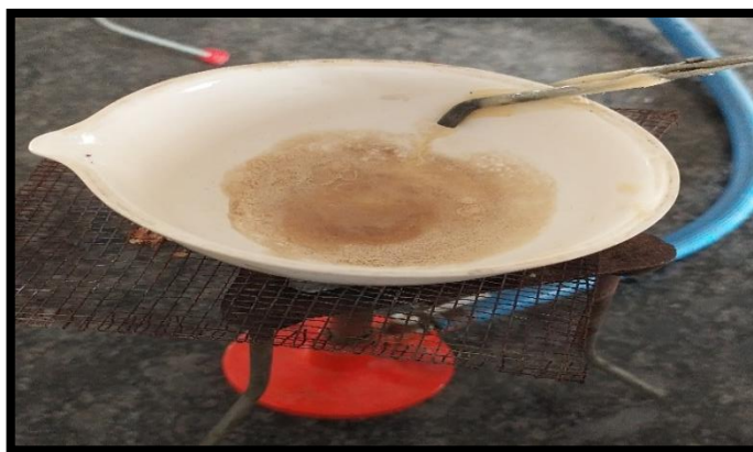
Figure no.17 Determine Percent of Solid Content