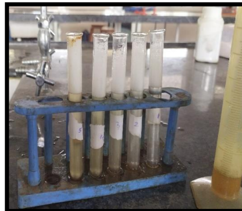
Figure no.20 Foaming Ability and Foam Stability