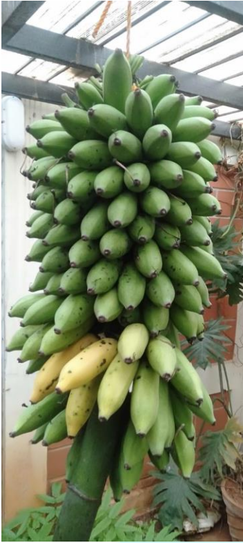
Image : 3.2.1 : Banana Fruit grown in a wetland at a Residential home in urban having size 0.75 MX 3.5MX2,25M