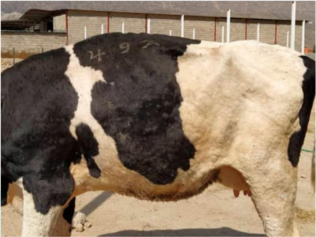
Figure 3. Lumpy skin disease. Raised, circumscribed nodular lesions

The differential diagnosis of LSD includes the following conditions: pseudolumpy skin disease, urticaria, streptotrichosis ( Dermatophilus congolensis infection), ringworm, Hypoderma bovis infection, photosensitization, bovine papular stomatitis, foot and mouth disease, bovine viral diarrhoea, and malignant catarrhal fever 53 .