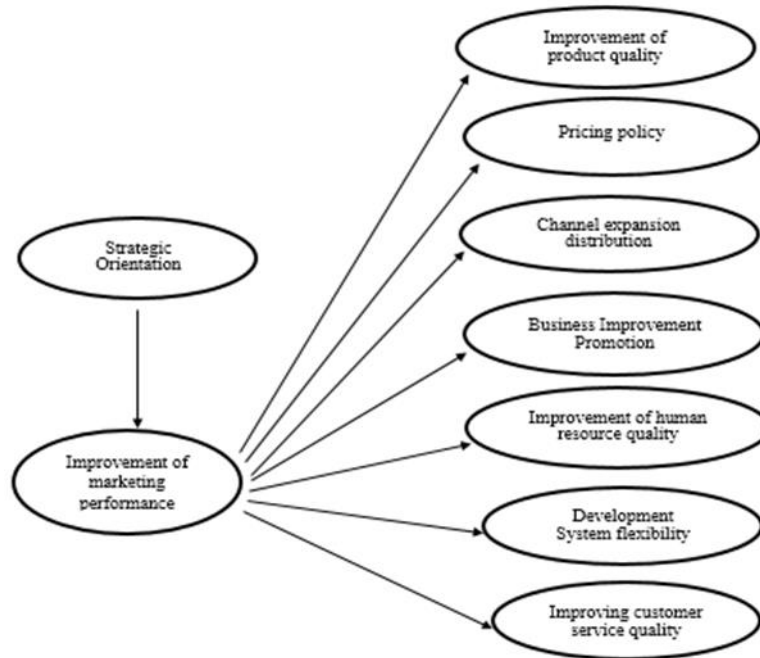
Figure 1 Research Framework