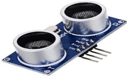
Fig. 3. ULTRASONIC SENSORS

Frequencies exceeding the range of human hearing are used in ultrasound vibration. A microphone that transmits and receives ultrasonic waves is referred to as a transducer. Like many other ultrasonic sensors, ours transmit pulses and listen for echoes using a single transducer. The location of a sensor measures the sound pulse's distance.