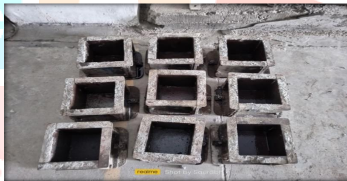
Fig no 2: Preparation of mold for casting

Generally metal mold are preferred first remove previous material with the help of hammer and to assembly ready for use the dimension and internal phase are required to be accurate within the following limit the assembly the mold for use the joint between the sexual of the mode are thinly coated with mold oil and similar coating of mole oil is apply between the contract surface of water of the mold and the best plate in order to ensure that no water scape during the interior surface of the assembly mode is also required to be thinly Coted with moral oil to prevent forever project 150 * 150 * 150 mm cube mod where creeper after applying the oil we are ready for casting then sample wear casted and live for 24 hours for remolding.