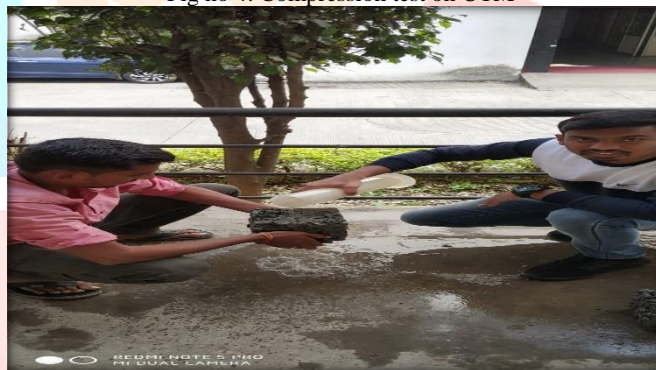
Fig no 5: Permeability test