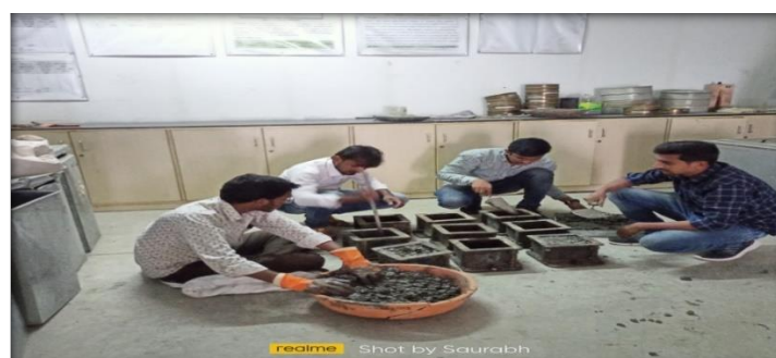
Fig no 3: Compaction of mold

After oiling the steel mold, the concrete material was filled into mold. The concrete was poured into the mold in three layers and tamping each layer by 35 times. The steel road is using is 16mm diameter and 600 mm long. After tamping the concrete mold is placed on the vibration machine to vibrate. When the vibration is completed, concrete mold set for 24 hours. After 24 hours remove from concrete cube.