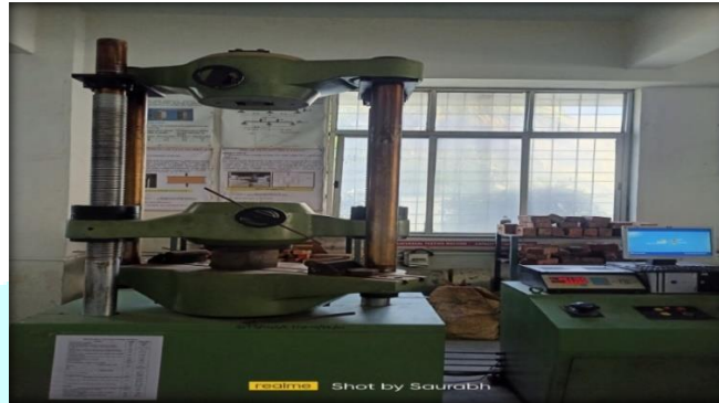
Fig no 4: Compression test on UTM

When their curing period was complete, they were taken out of the water and let it dry for a while. After drying for a while, two types of tests are to be performed on it. The first is Compression test and the second is permeability test. In the compression test, the concrete block was placed on the UTM machine to find out compression strength. In the permeability test the timing of one litter water passing through a concrete cube was measure. Thus, we have taken these two tests on porous concrete in this project.