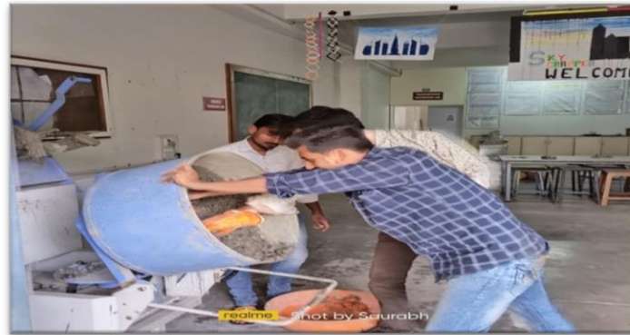
Fig no 1: Mechanical mixer after mixing

In this project we have taken all the material according to weight. we have use Birla Shakti cement 43 grade, and 20mm size of coarse aggregate are use. In the same way that we used use in concret drinkable water. In this concrete we have mixed soaked Recron 3s fiber We mix all this material properly mix in mechanical mixer after mixing remove all material and fill metal cube.