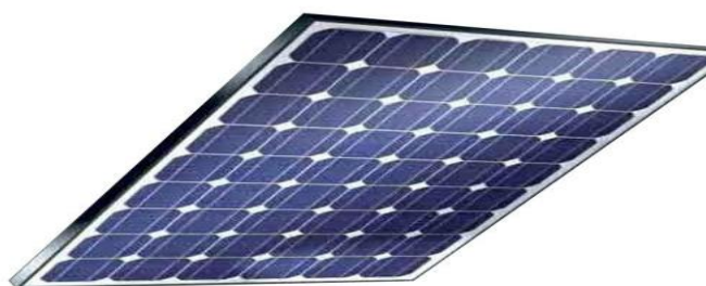
Fig 2: solar panel

1.solar panel:A solar cell (also known as a photovoltaic cell or PV cell) is defined as an electrical device that converts light energy electrical energy through the photovoltaic effect.