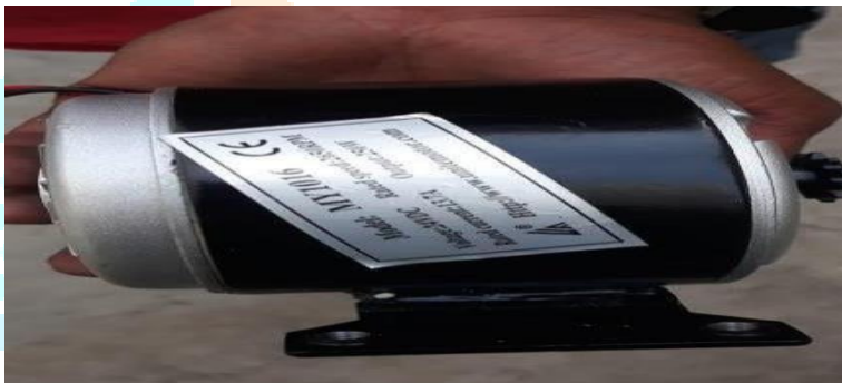
Fig 5: PMDC

3. permanent magnet DC motor (PMDC): PMDC motor, stator field is generated by permanent magnet and hence the field remains constant. Due to constant stator field, linear torque/speed characteristics can be obtained. PMDC motor provides high torques; it is widely used in the application where accurate position control is required. In this project the motor need starting torque as to be high that's why this project use permanent magnet DC motor of following rating